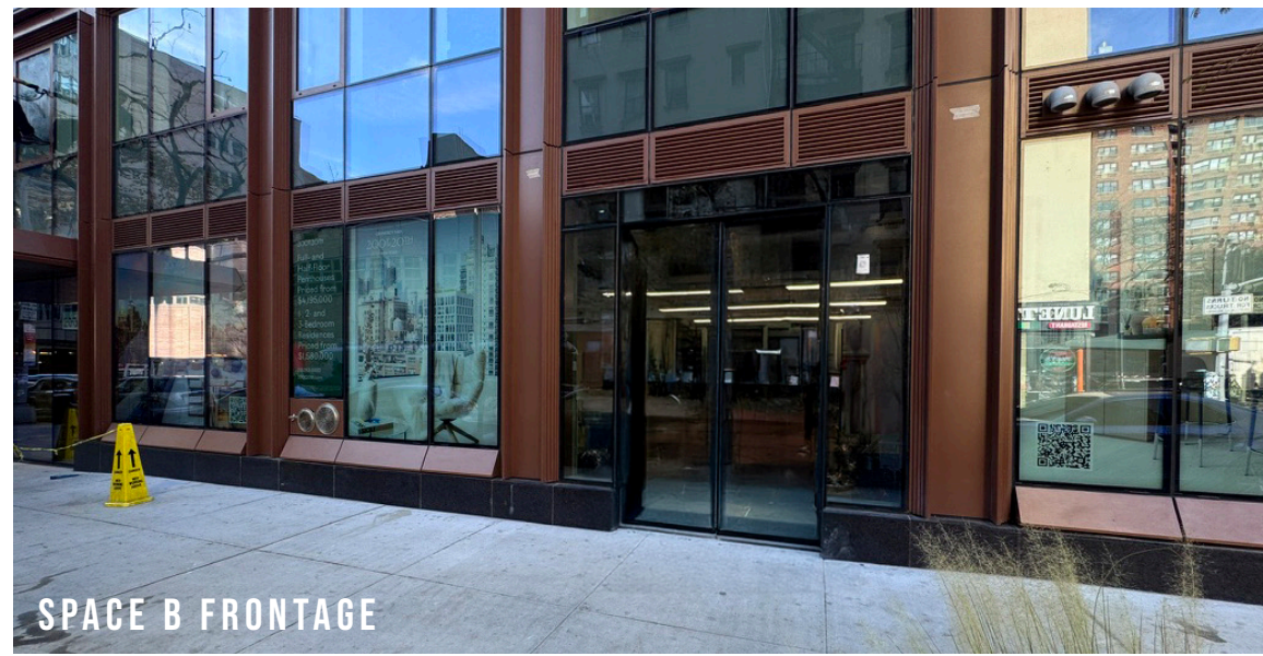
SPACE B FRONTAGE