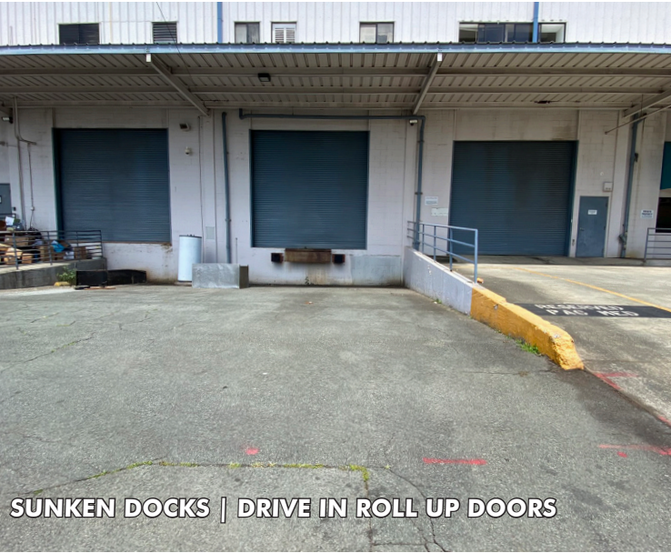
SUNKEN DOCKS | DRIVE IN ROLL UP DOORS