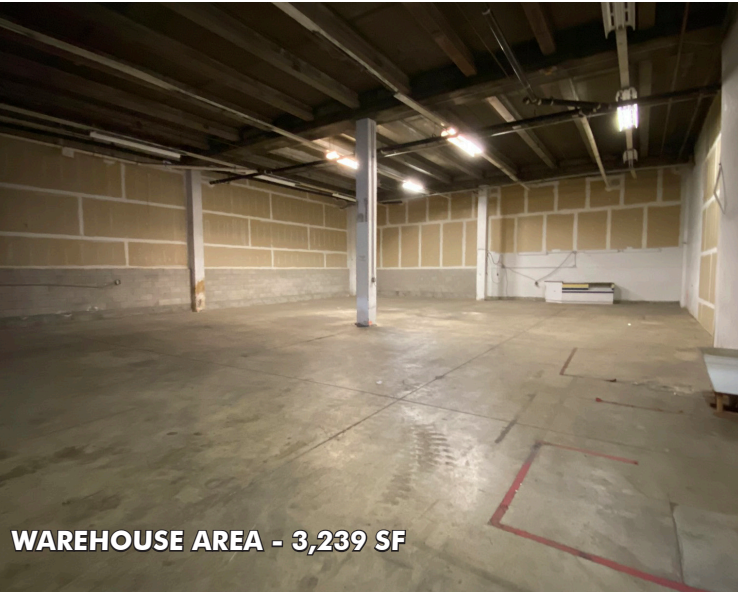
WAREHOUSE AREA - 3,239 SF