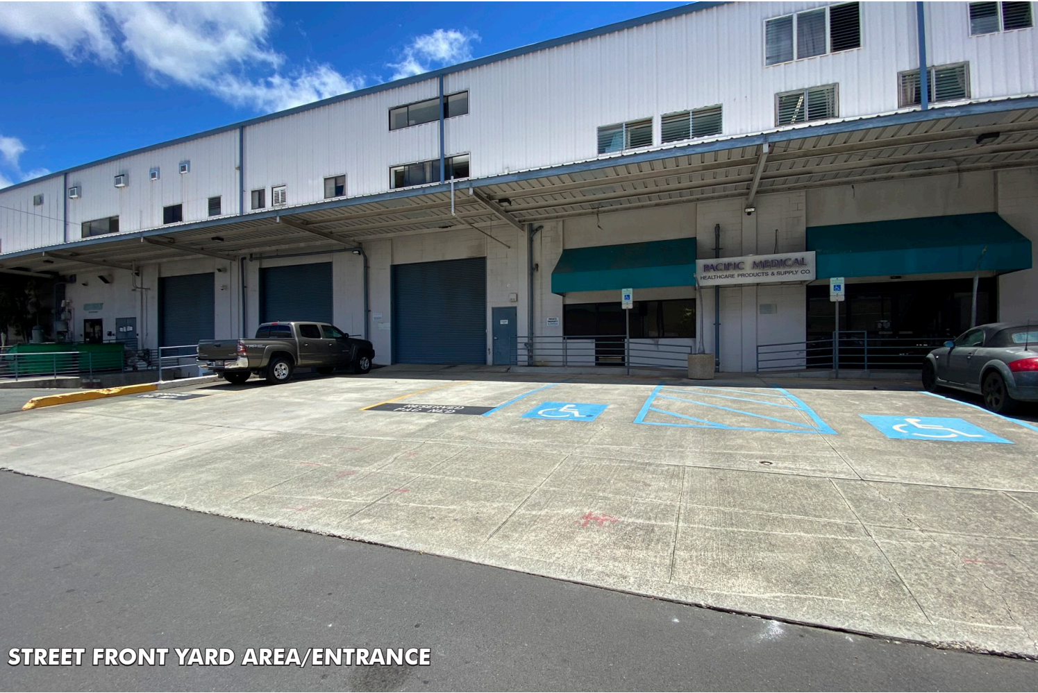
STREET FRONT YARD AREA/ENTRANCE

Iwilei Center is pleased to offer a spacious warehouse, conveniently located on Iwilei Road within approximately 4 minutes (0.50 miles) driving distance from downtown Honolulu and approximately 6 minutes (4.3 miles) to Honolulu International Airport.