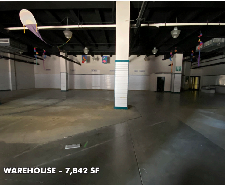
WAREHOUSE - 7,842 SF