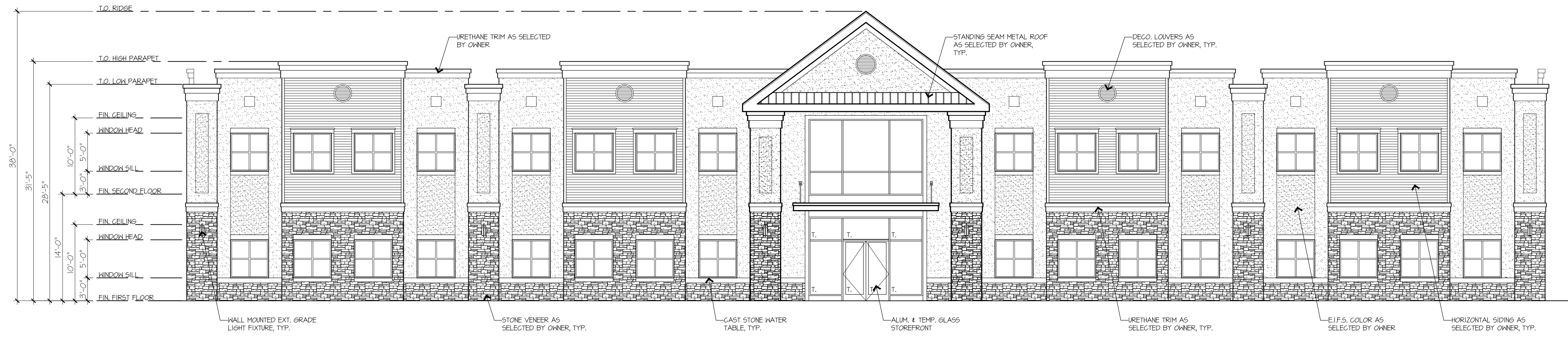
1 PROPOSED FRONT ELEVATION PB-2 SCALE: 1/8" = 1'-0"