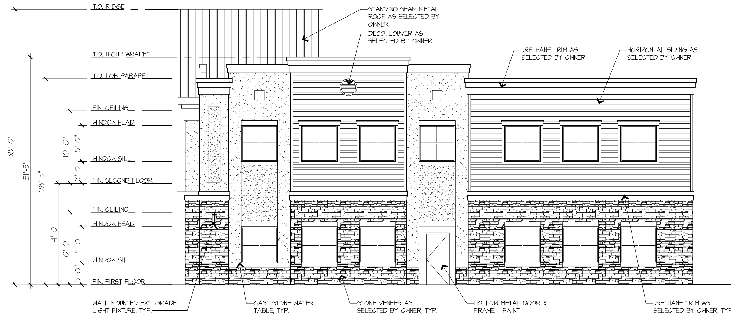
2 PROPOSED RIGHT SIDE ELEVATION PB-2 SCALE: 1/8" = 1'-0"