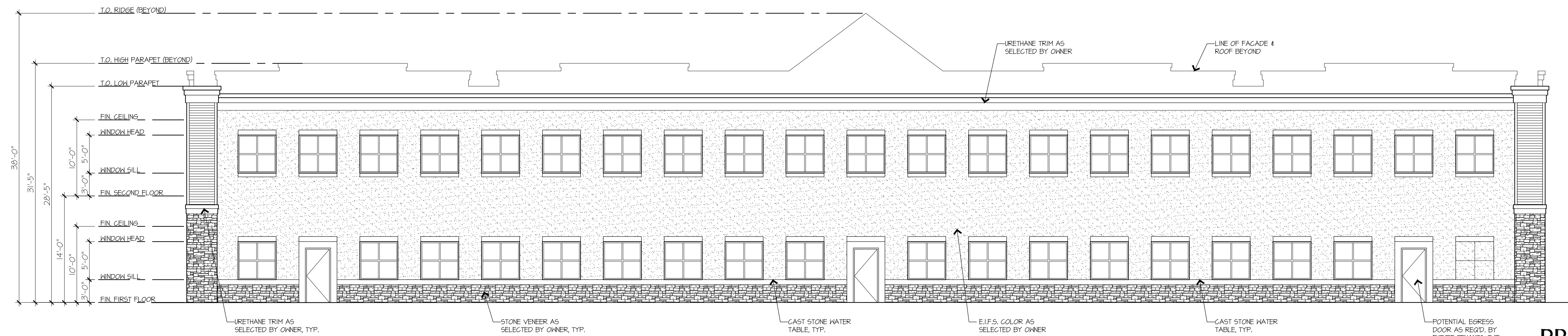
4 PROPOSED REAR ELEVATION PB-2 SCALE: 1/8" = 1'-0"