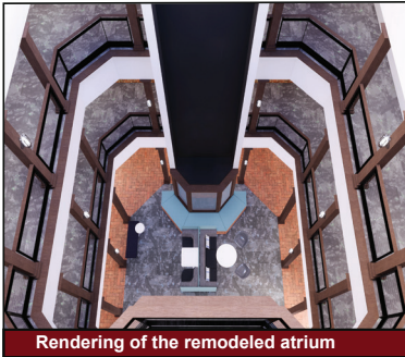
Rendering of the remodeled atrium