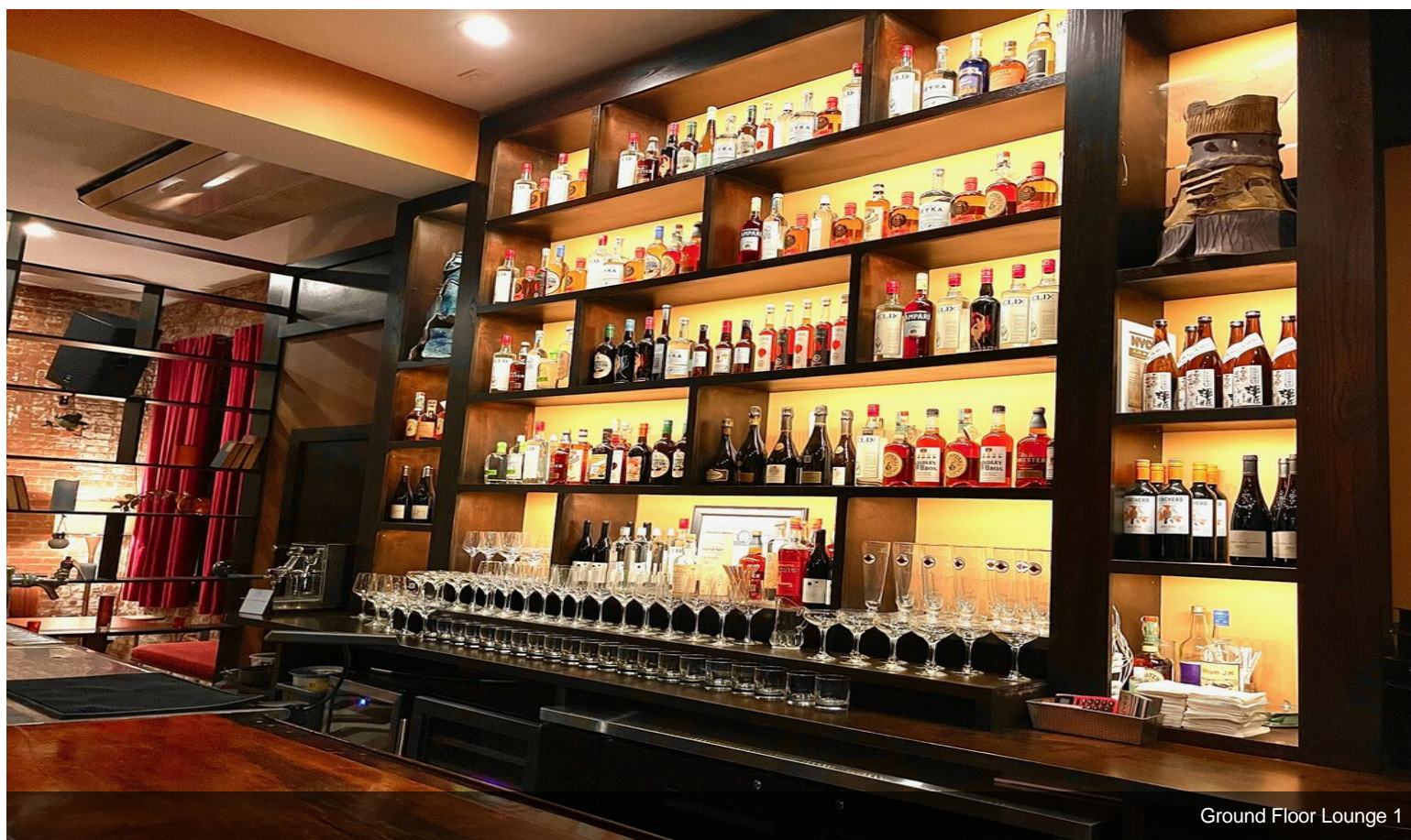
Ground Floor Lounge 1