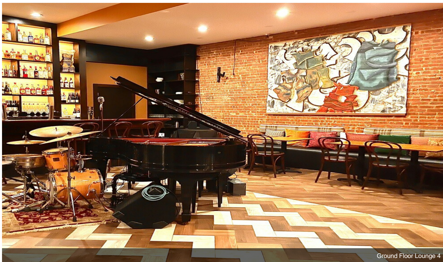
Ground Floor Lounge 4