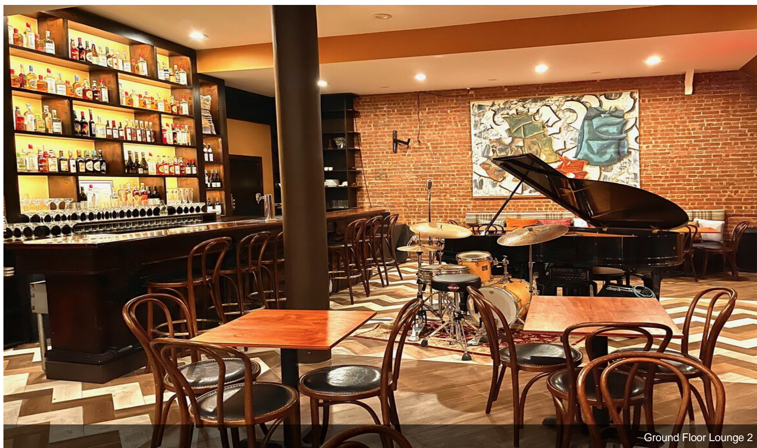
Ground Floor Lounge 2