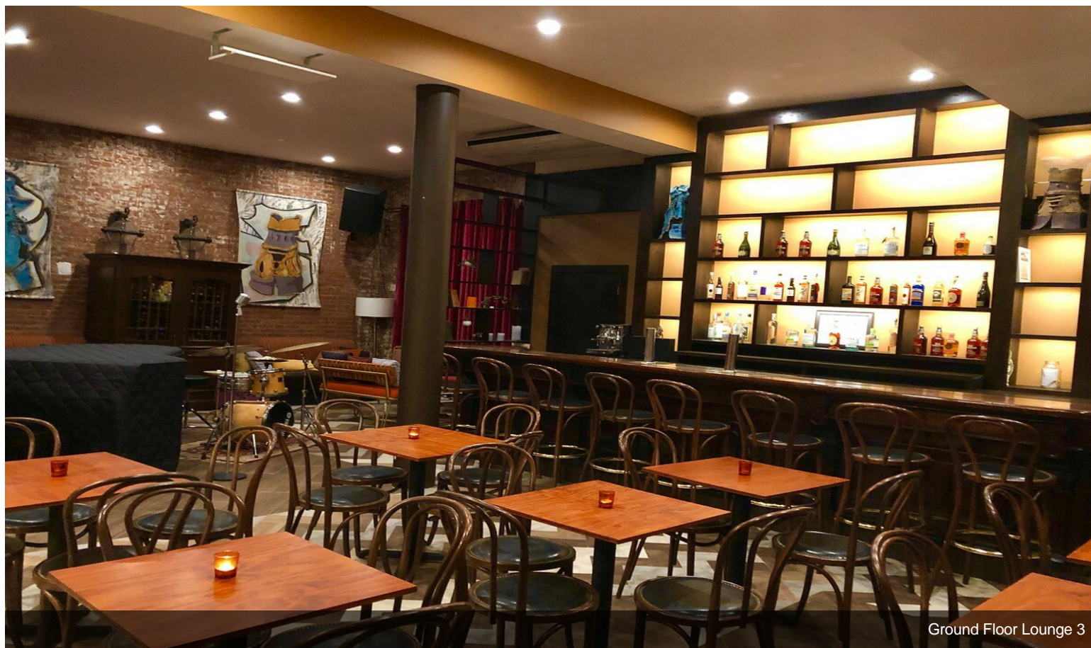
Ground Floor Lounge 3