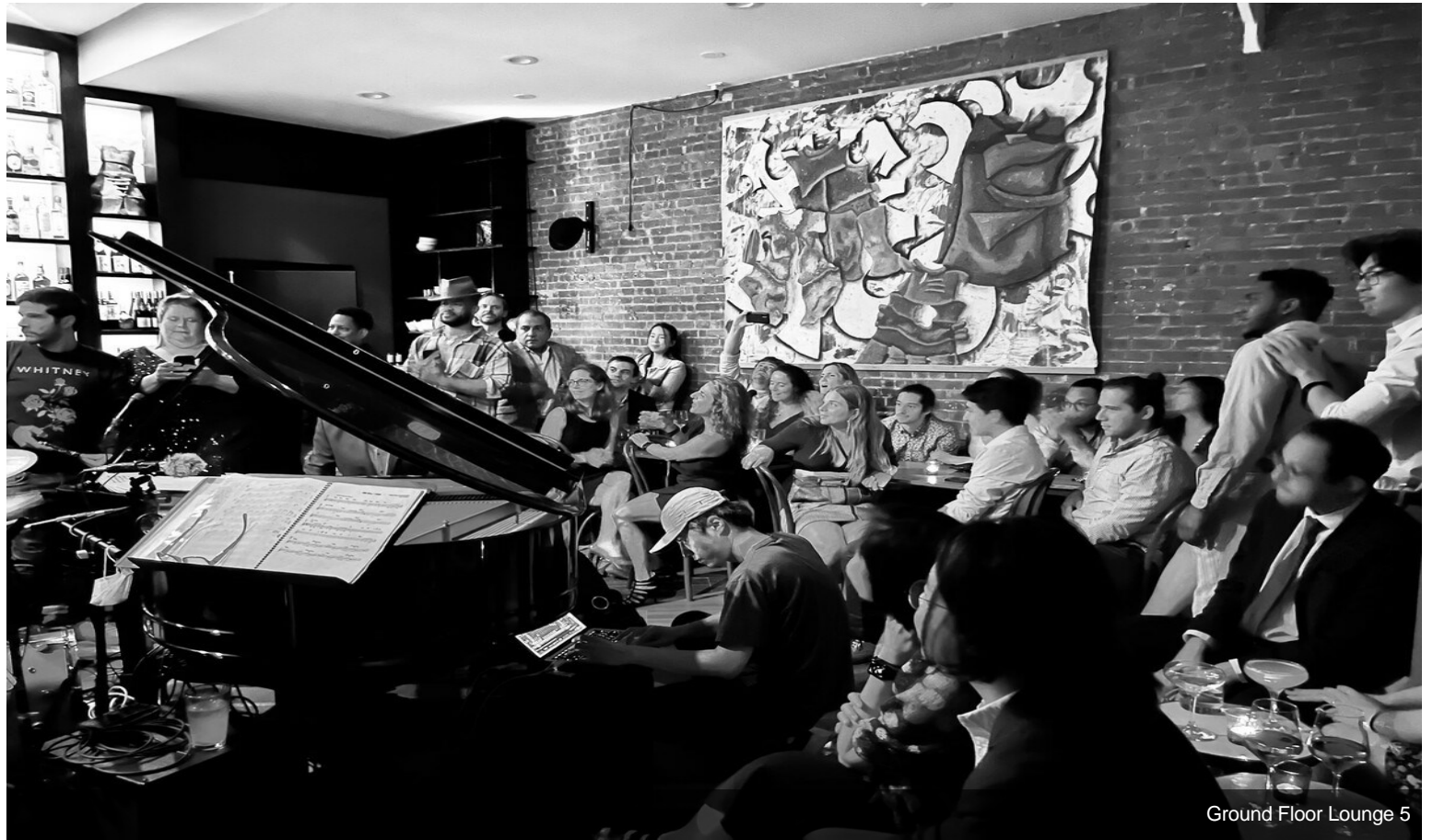
Ground Floor Lounge 5