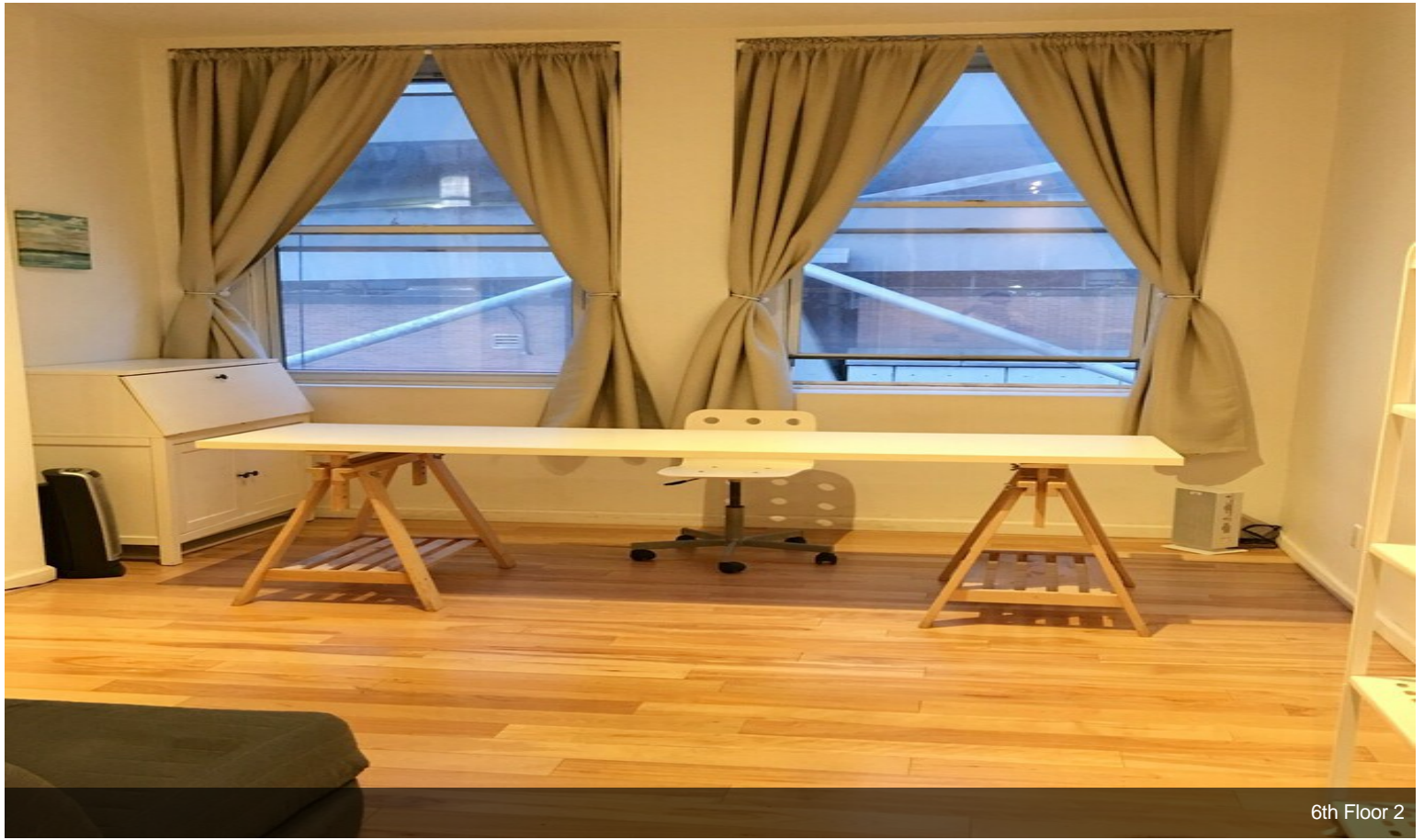
6th Floor 2