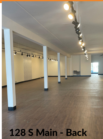
128 S Main - Back