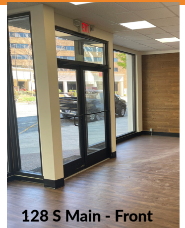
128 S Main - Front