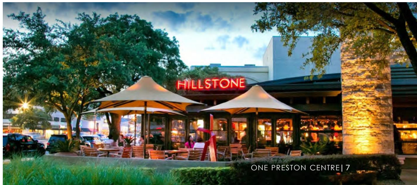
ONE PRESTON CENTRE | 7