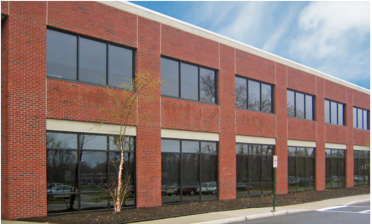
1355 Campus Parkway existing building