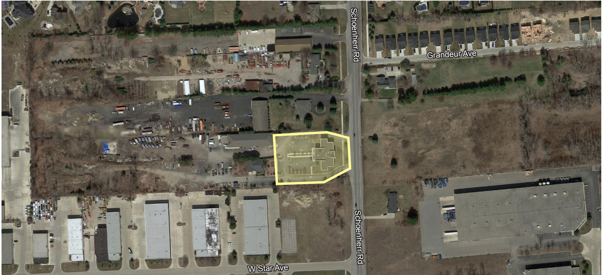
The information contained herein has been given to us by the owner of the property or other sources we deem reliable. We have no reason to doubt its accuracy, but we do not guarantee it. All information should be verified prior to lease or purchase.