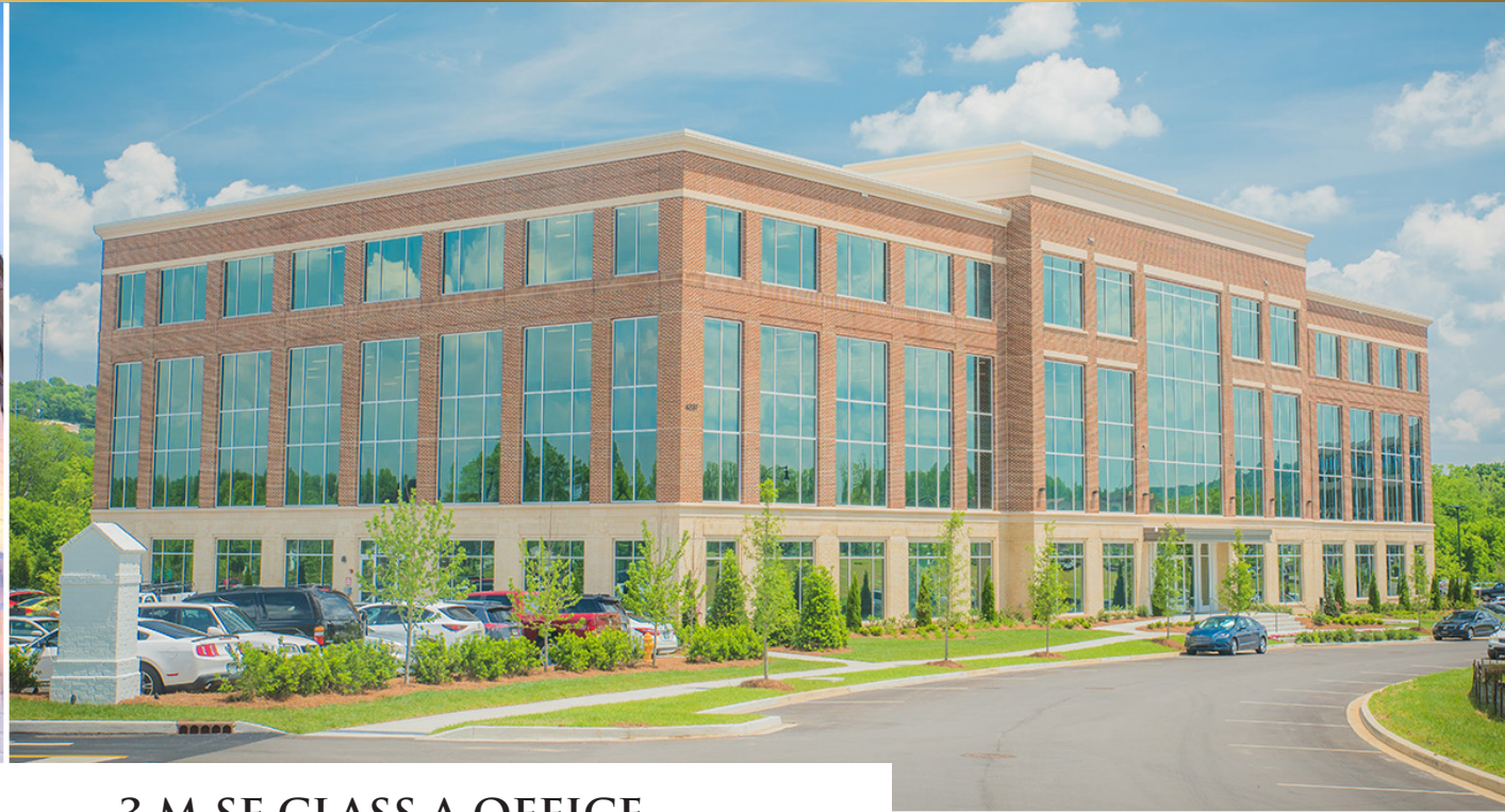
3 M SF CLASS A OFFICE