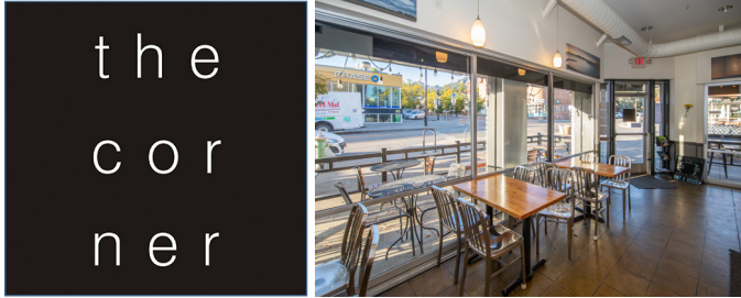
The Corner - 1100 13th Street