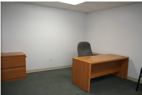
Typical office (3X)