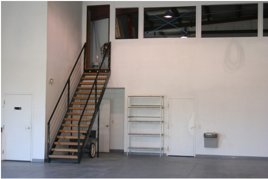
Stairs to loft area next to bathrooms