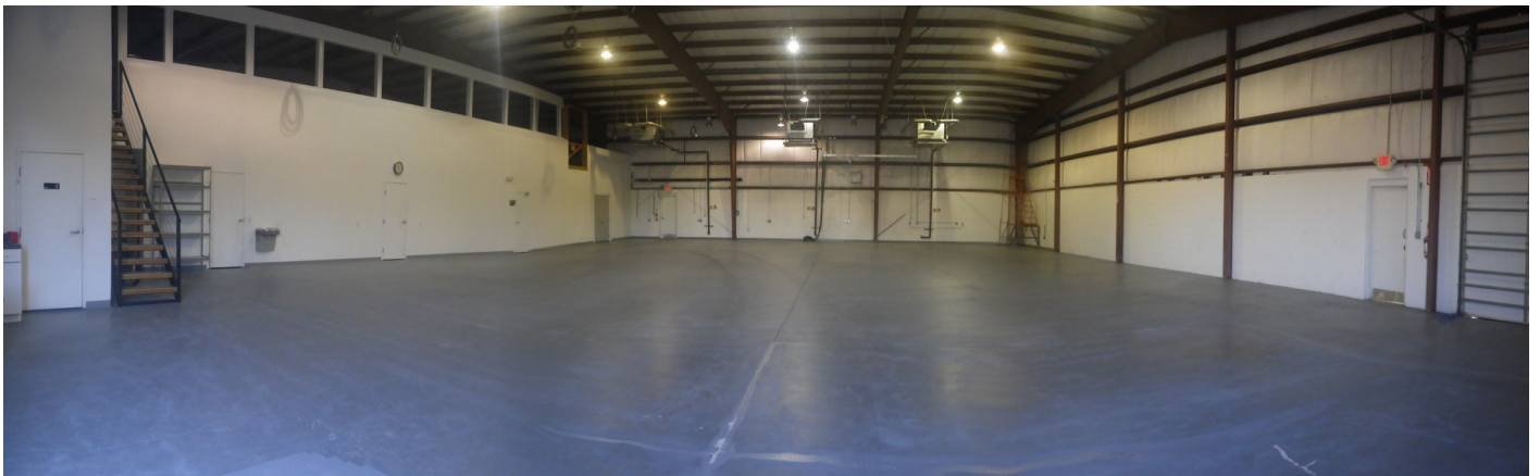
A/C manufacturing / warehouse with doors to offices and loft area on left side