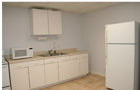
Office area lunch room