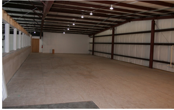
Loft area with led floodlights