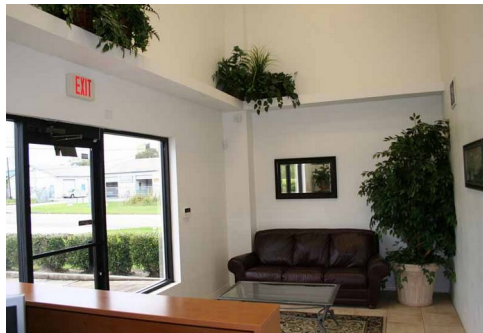
2 story lobby