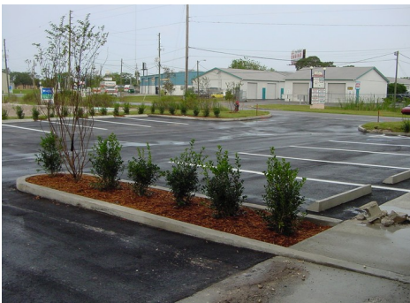
West view of parking lot