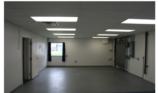
Open computer and file storage