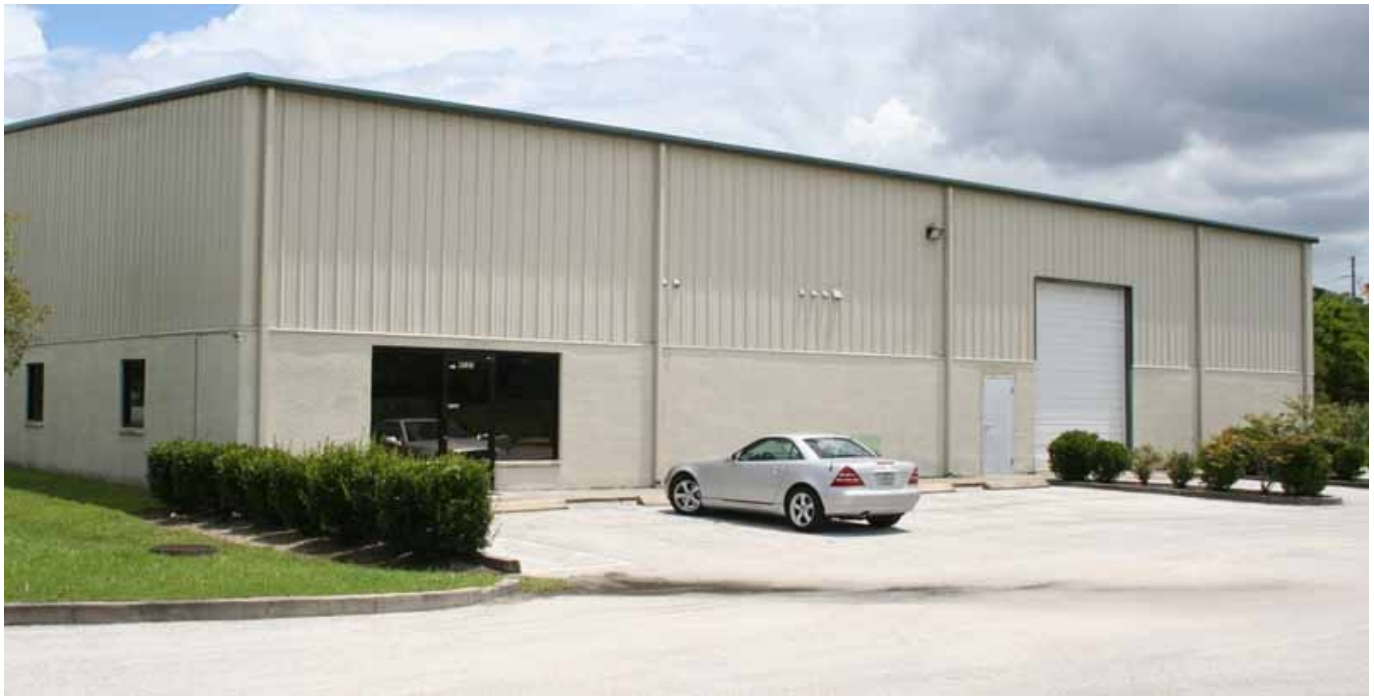
4126 Louis Avenue entrance