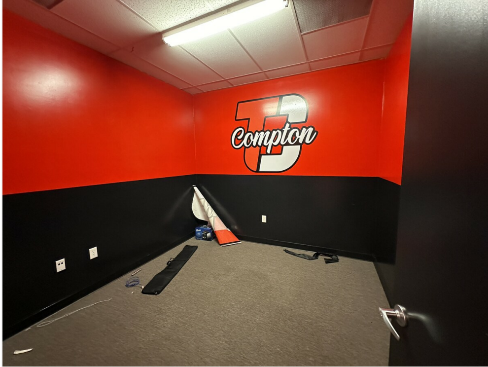
Private Offices in Building #2