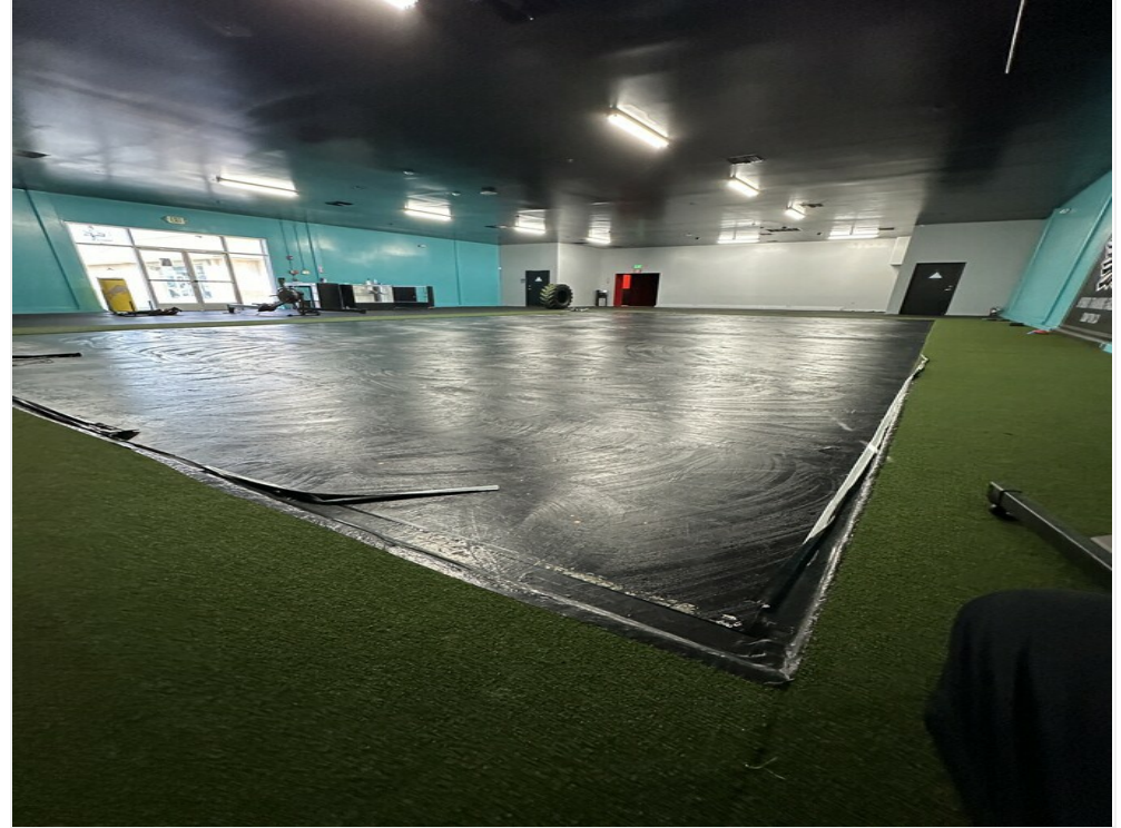
Great for Gym, Playground, Office Bullpen, Etc.