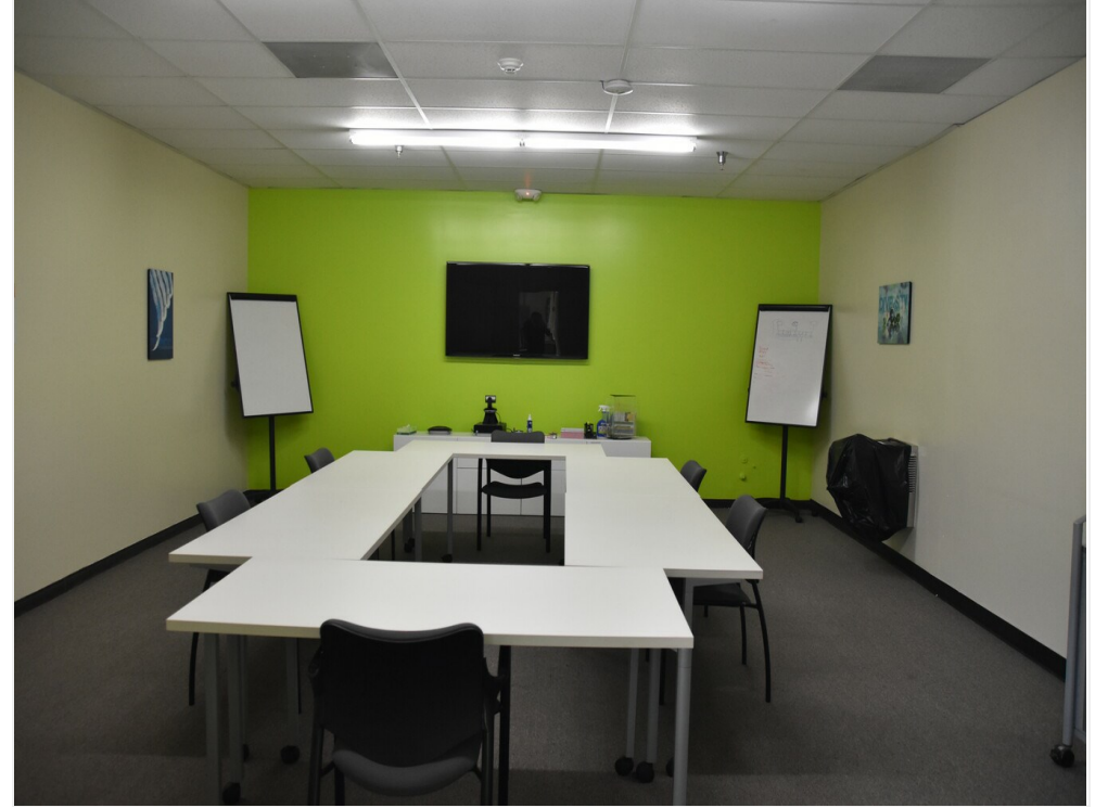
Conference Room of Former Tenant, The Children's Institute