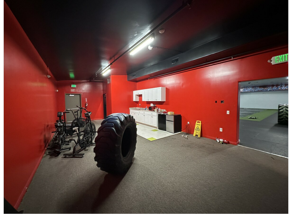
Kitchen Area of Building #1