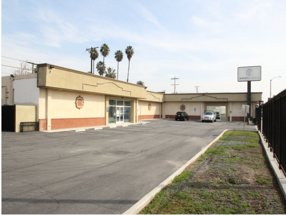
Building Photo of Former Tenant, The Children's Institute