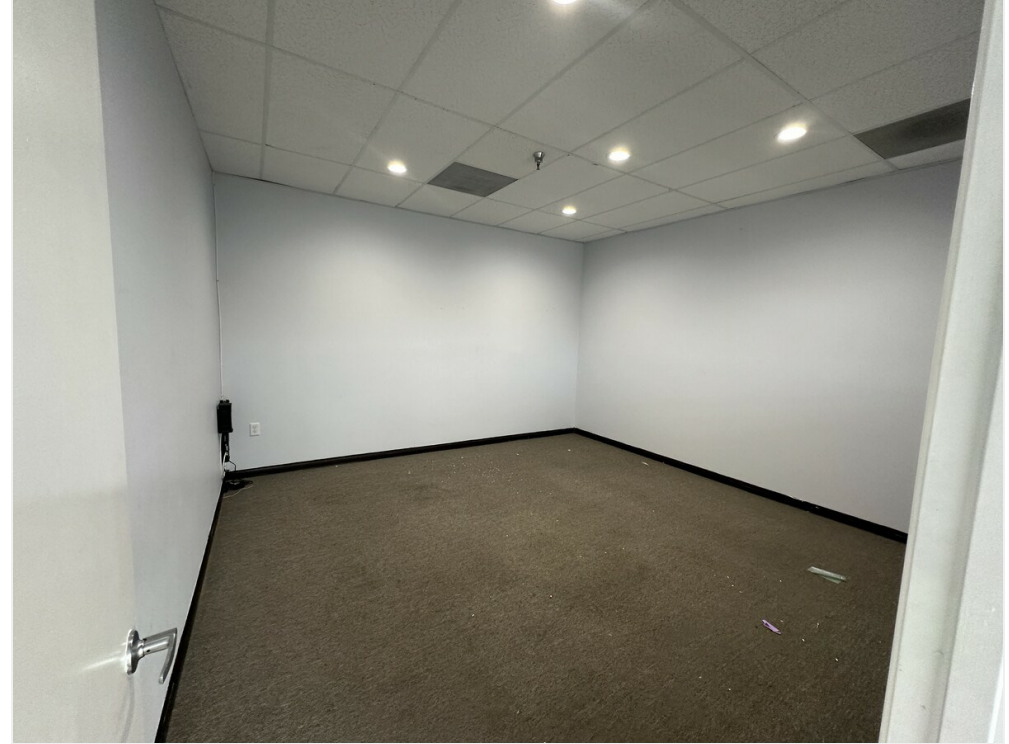
Private Office in Building #3