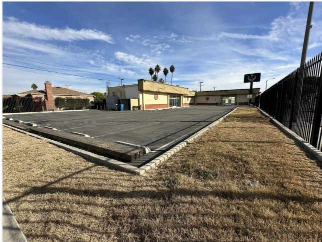
Large Gated Parking Lot

509-523 E Rosecrans Ave, Compton, CA 90221