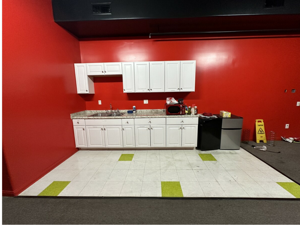
Kitchen Area of Building #1