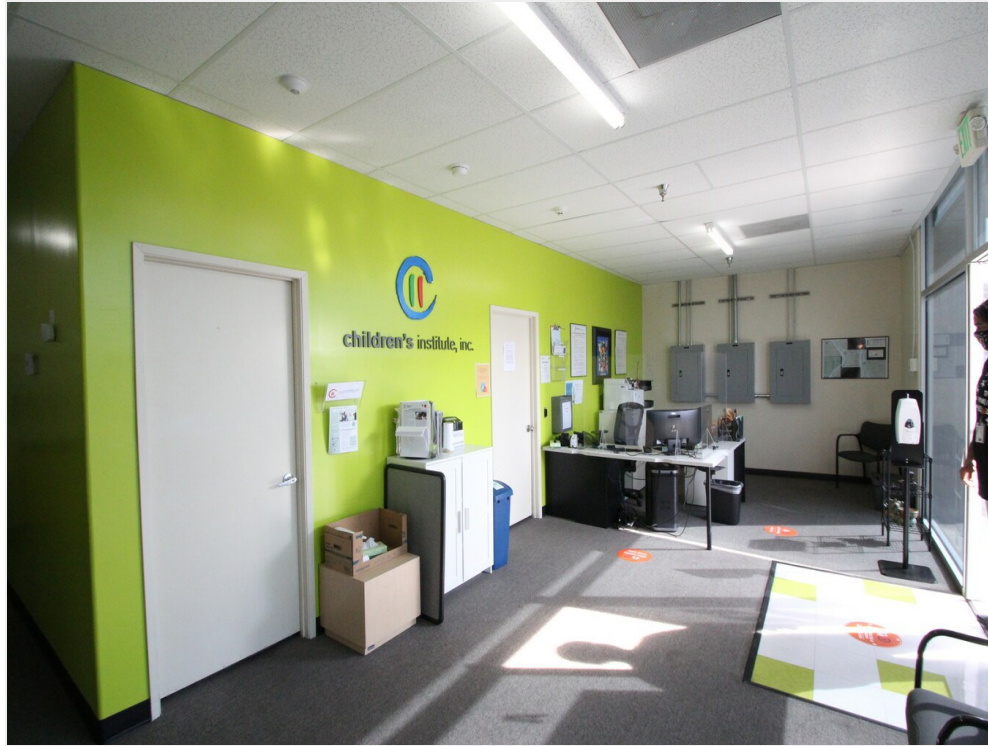
Lobby of Former Tenant, The Children's Institute