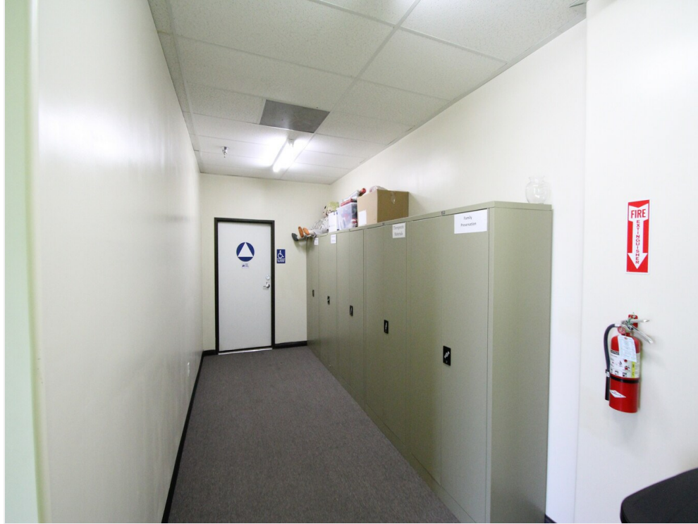
Hallway and ADA Restroom