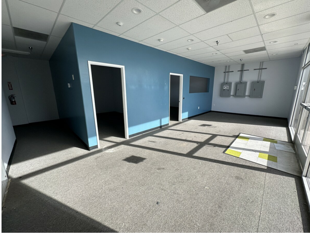
Lobby and Private Offices in Building #3