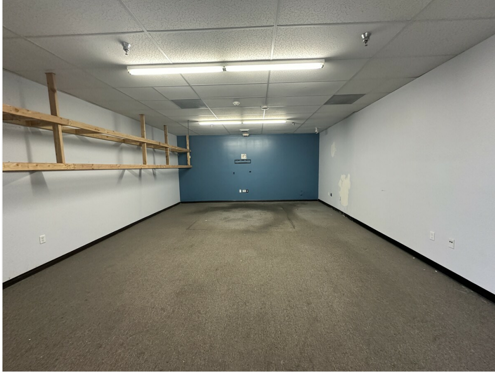
Large Conference Room in Building #3