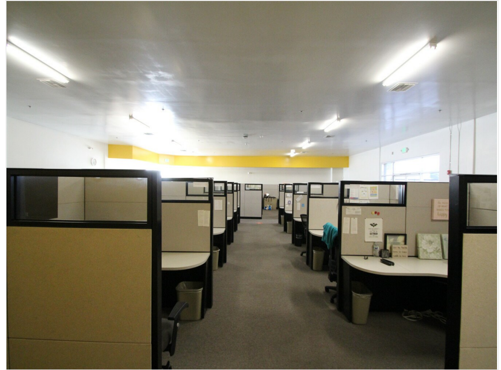
Cubicles of Former Tenant, The Children's Institute