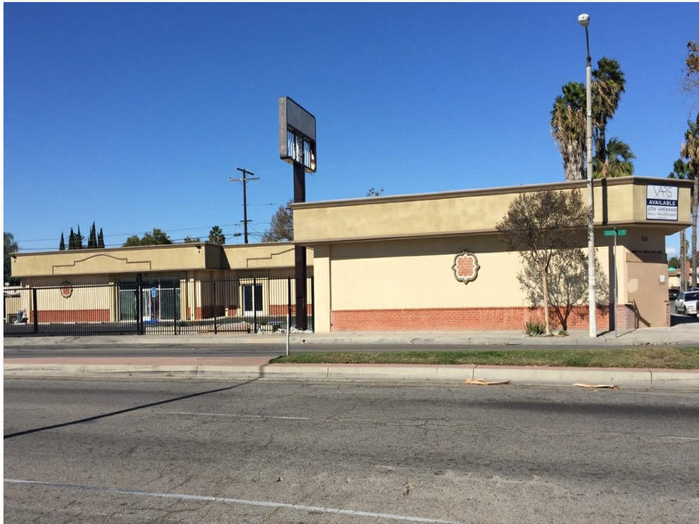
Zoomed Exterior from Rosecrans