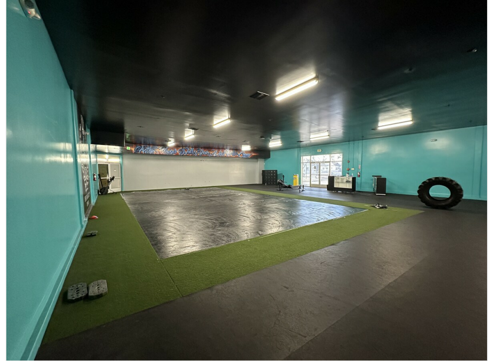
Large Main Area of Building #1