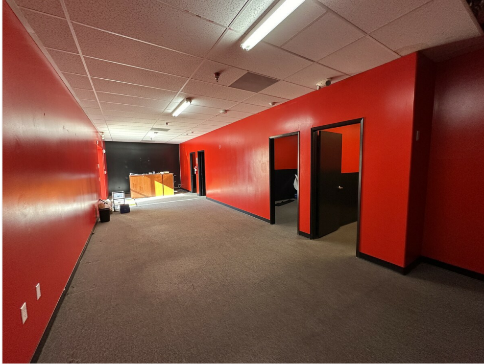
Lobby and Private Offices in Building #2