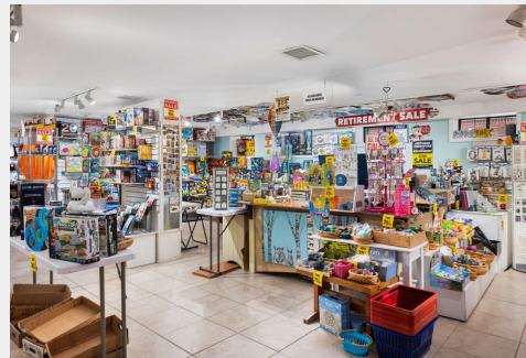
32 Main St. #3-4