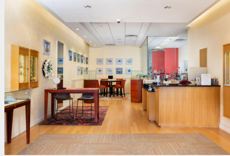
32 Main St. #1