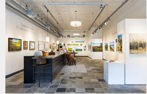
32 Main St. #2