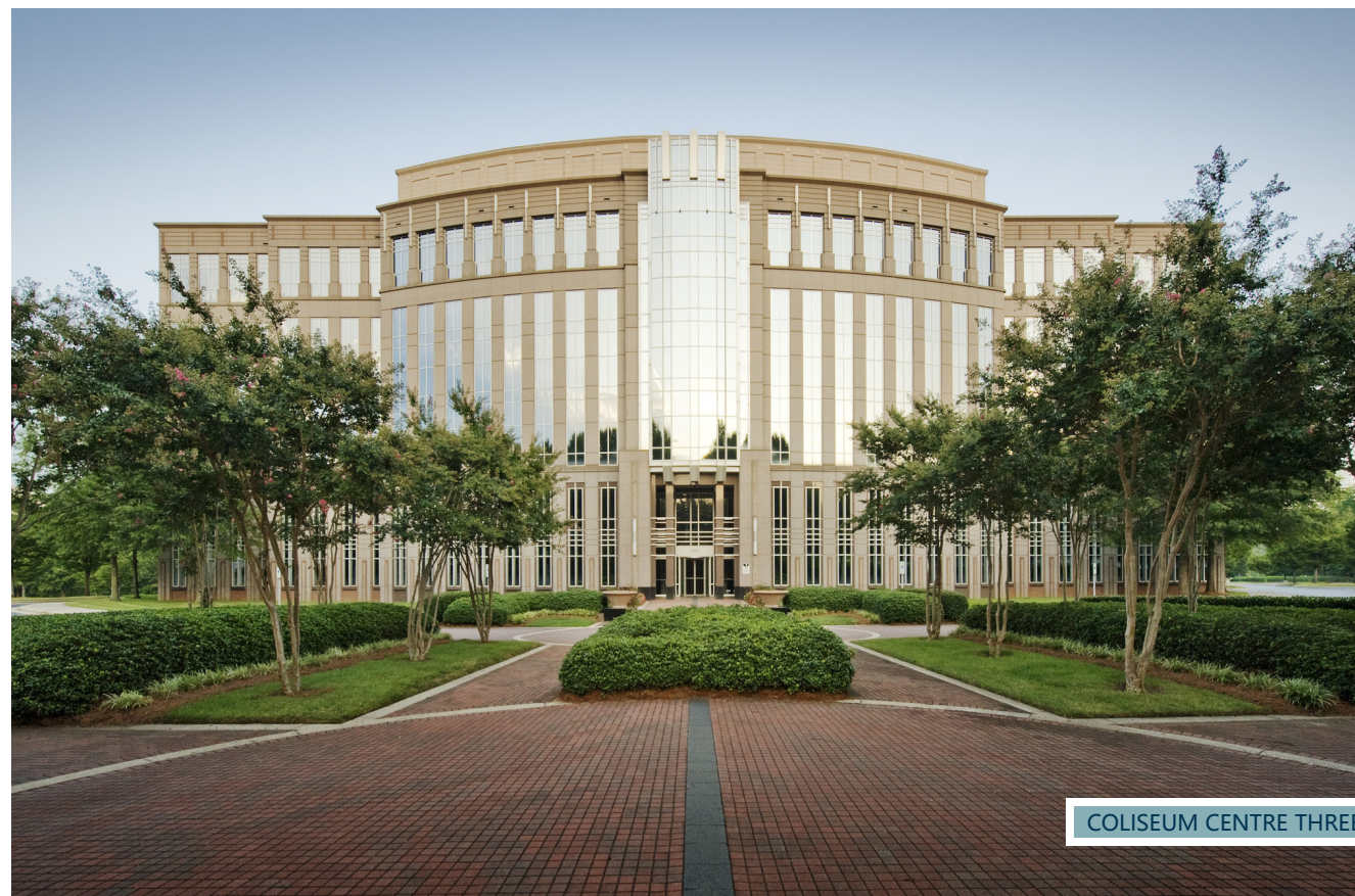
COLISEUM CENTRE THREE