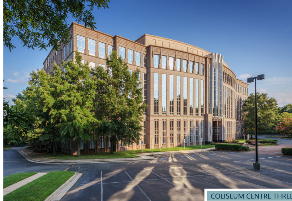
COLISEUM CENTRE THREE

Walking Distance to To Hotels, Restaurants & Retail