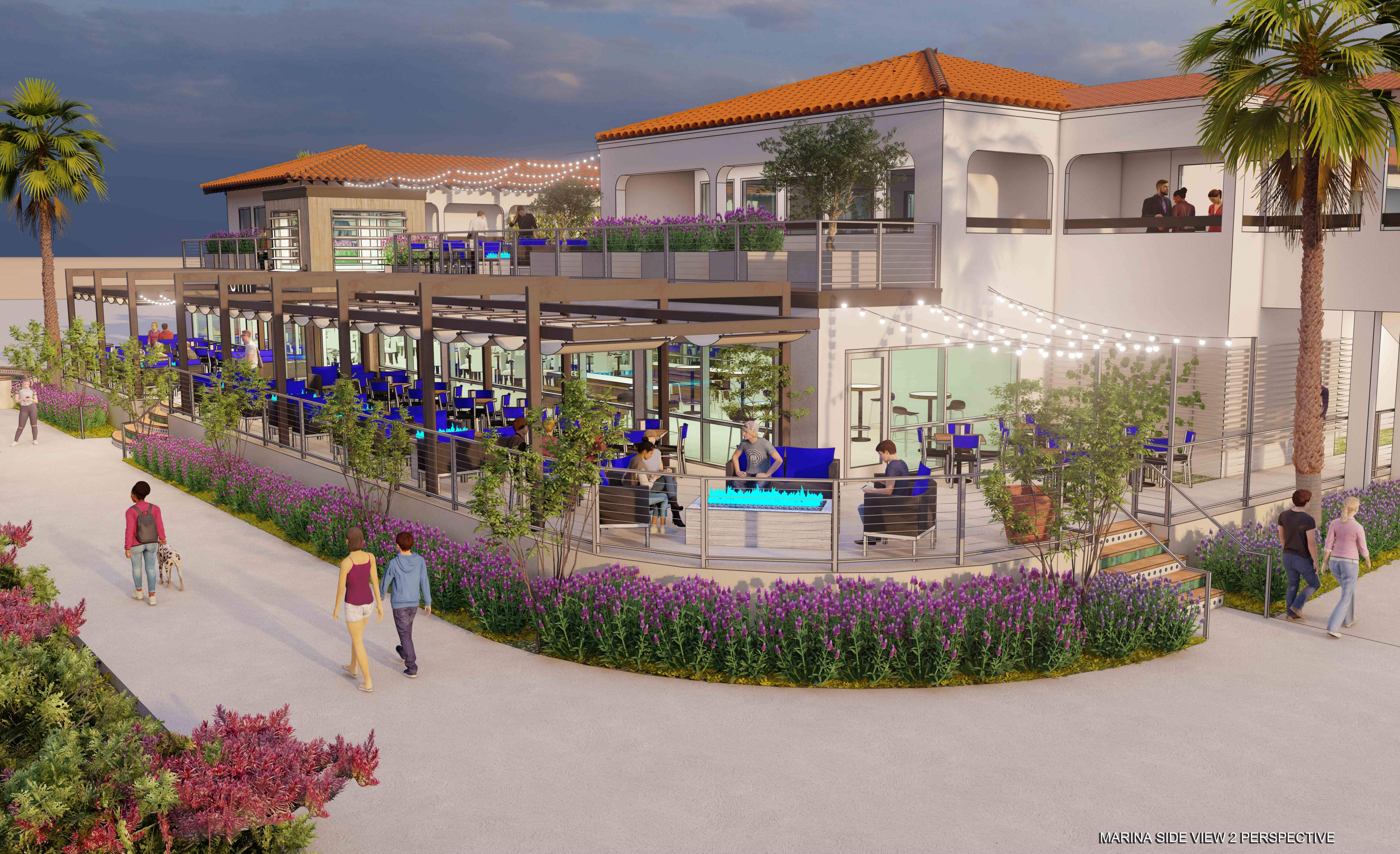
MARINA SIDE VIEW 2 PERSPECTIVE