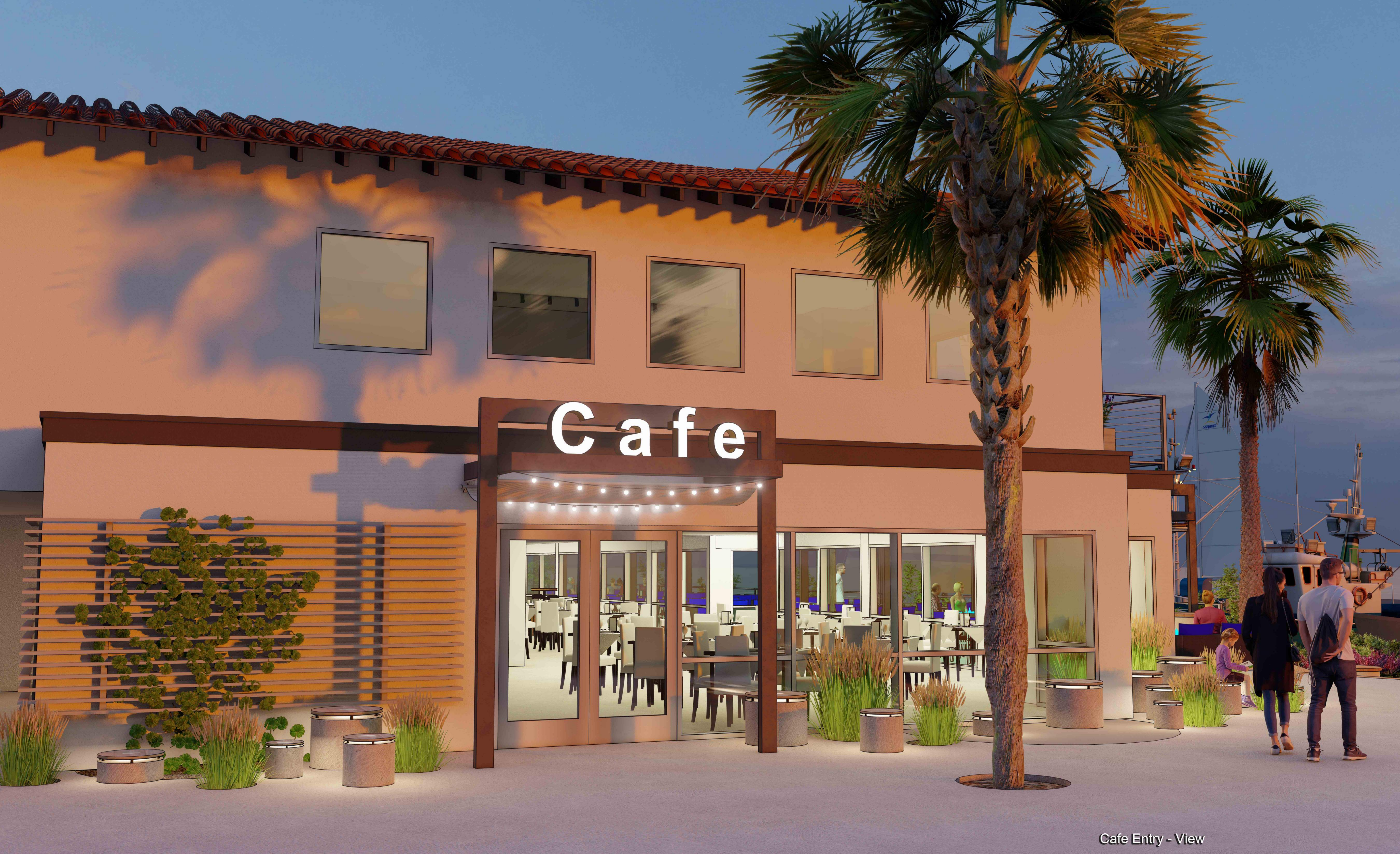
Cafe Entry - View