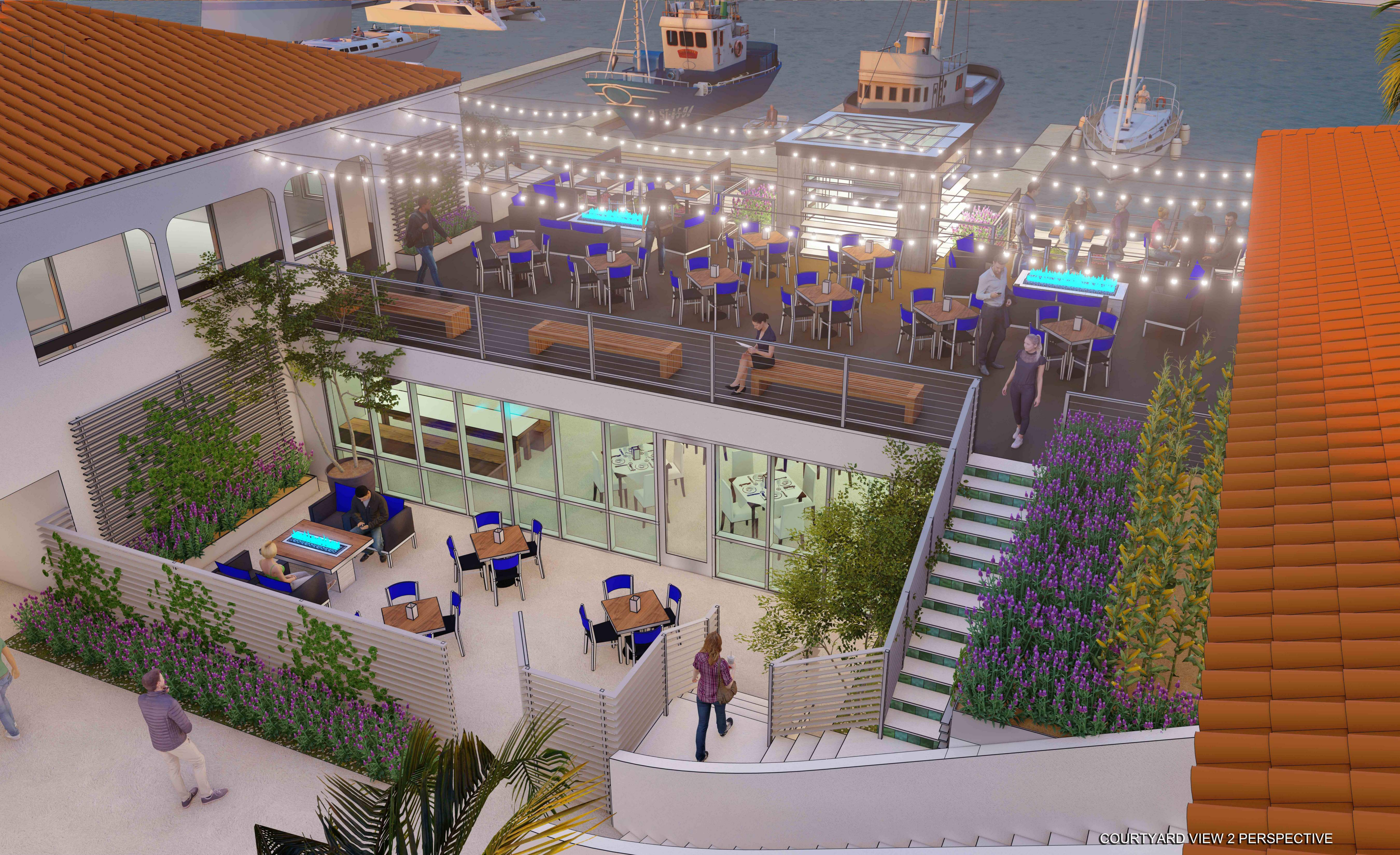
COURTYARD VIEW 2 PERSPECTIVE