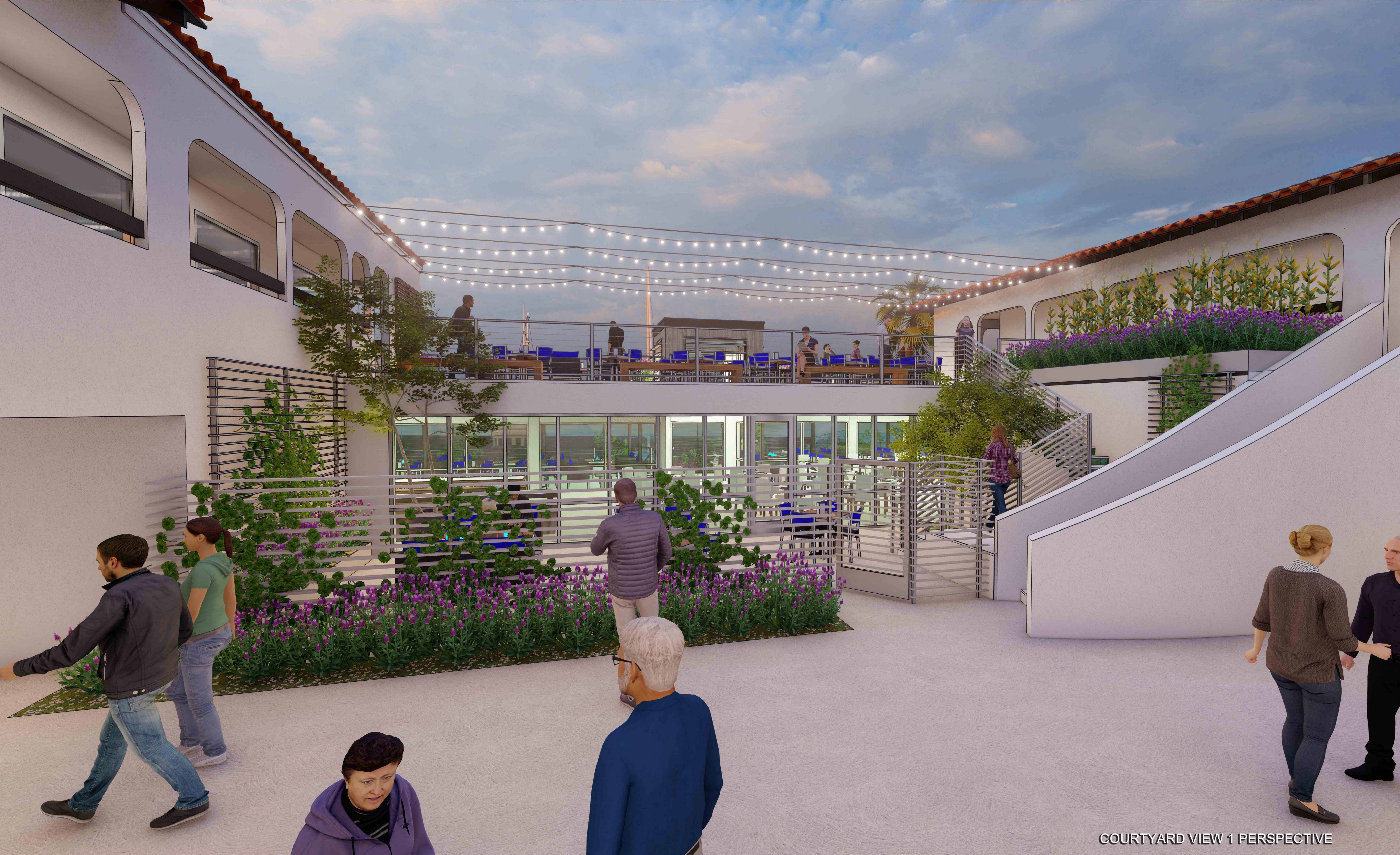
COURTYARD VIEW 1 PERSPECTIVE