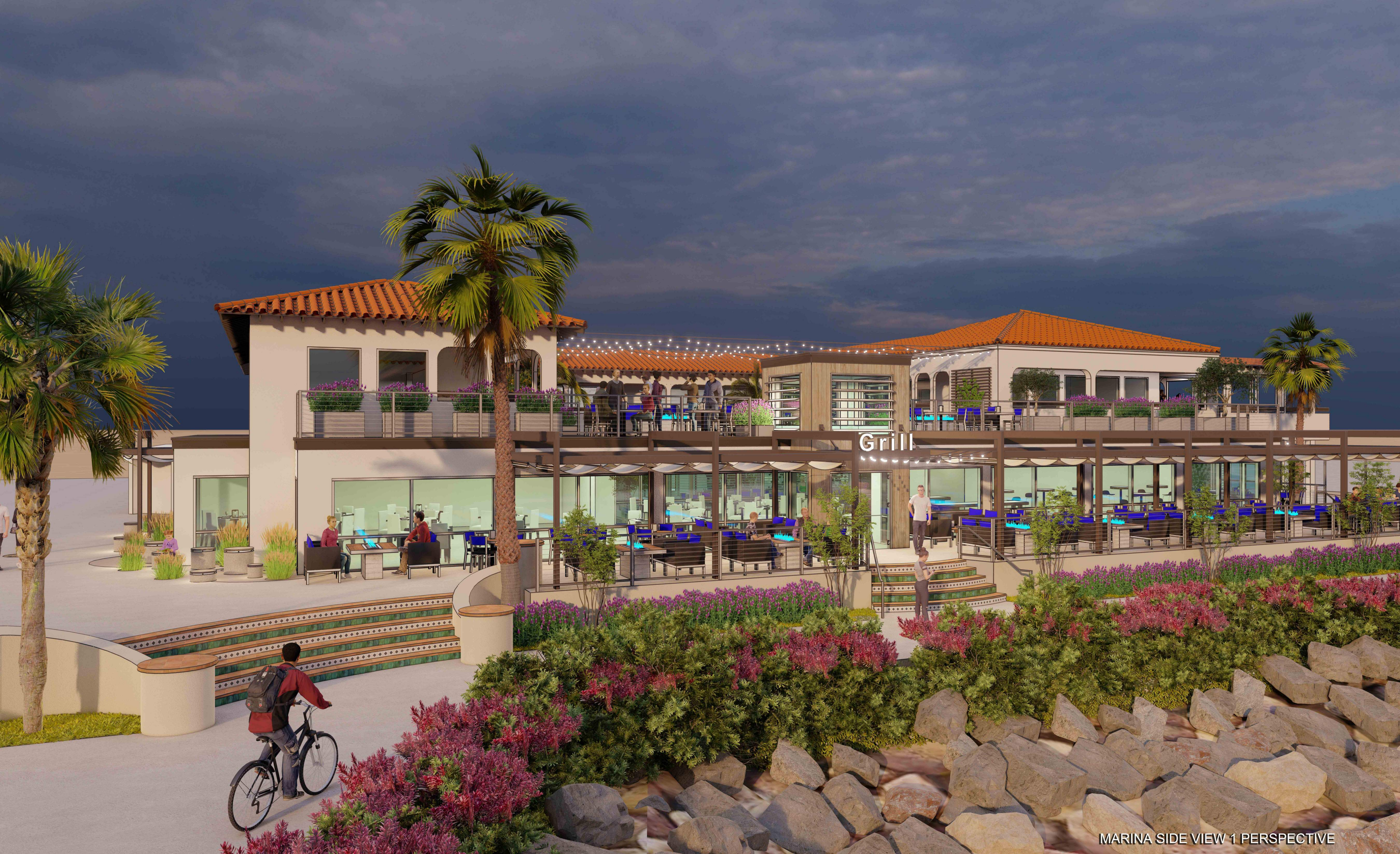
MARINA SIDE VIEW 1 PERSPECTIVE