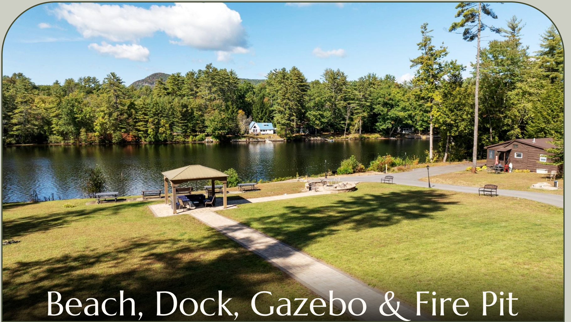
Beach, Dock, Gazebo & Fire Pit