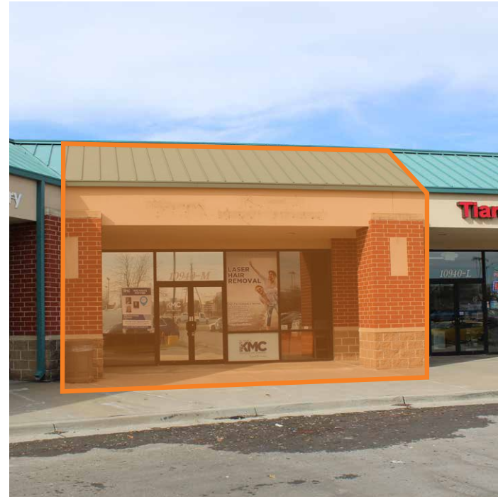
SUITE M 2,167 SF - Current Medical Buildout