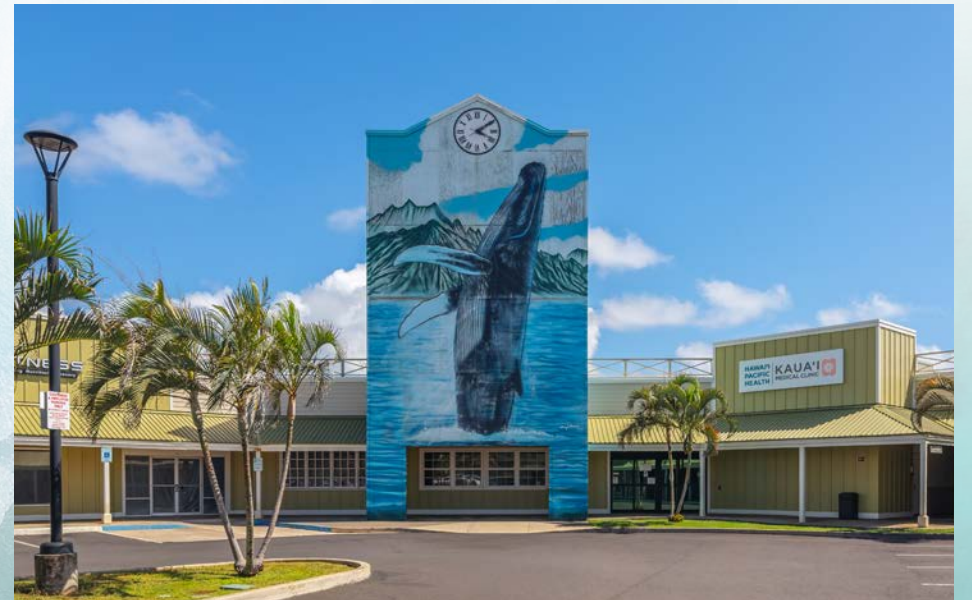
Kauai Village Shopping Center | 4-831 Kuhio Highway Kapaa, HI 96746