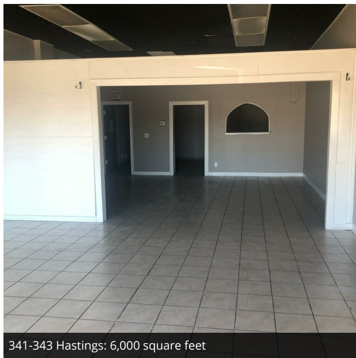
341-343 Hastings: 6,000 square feet

CATHY DERR | cathy@gwamarillo.com | 806.373.3111