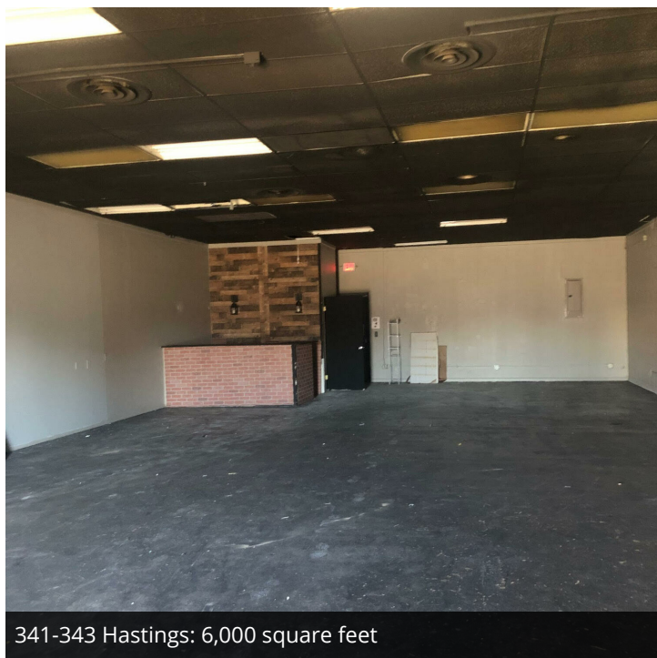
341-343 Hastings: 6,000 square feet