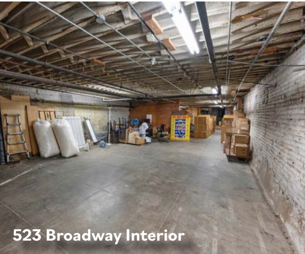
523 Broadway Interior

This is a rare opportunity to secure a well-located Downtown LA retail property with upside potential in one of the city's most dynamic urban markets.