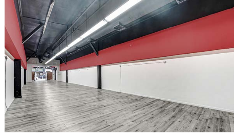
525 Broadway Interior