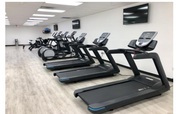
Bank of America Building - Fitness Center