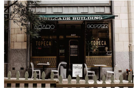
Topeca Coffee – Philcade Building