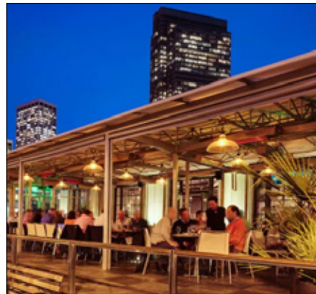
LA MAR CEBICHERIA PERUANA