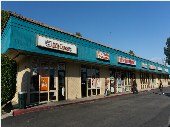
Existing Look - Will Change

7930 Dale St. & 8551 La P, Buena Park, CA 90620