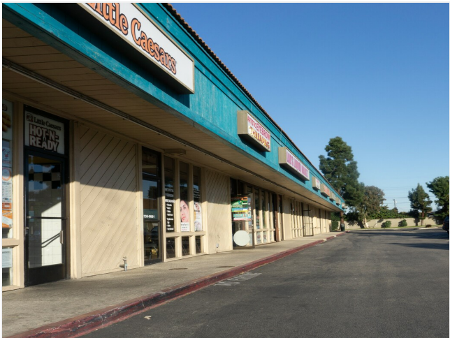
Existing Look- Will Change