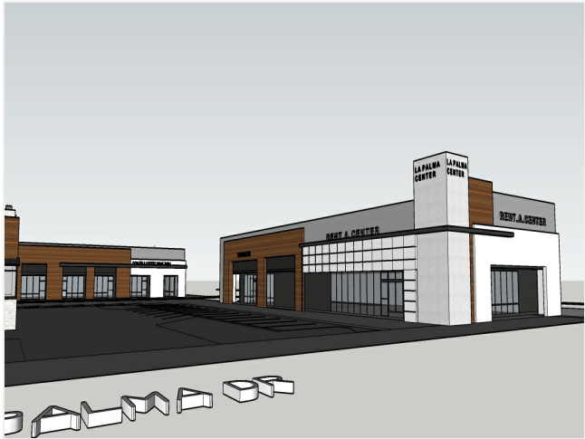
Coming Soon - New Look

7930 Dale St. & 8551 La P, Buena Park, CA 90620