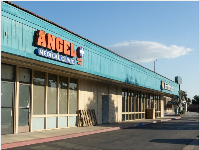
Existing Look - Will Change

7930 Dale St. & 8551 La P, Buena Park, CA 90620