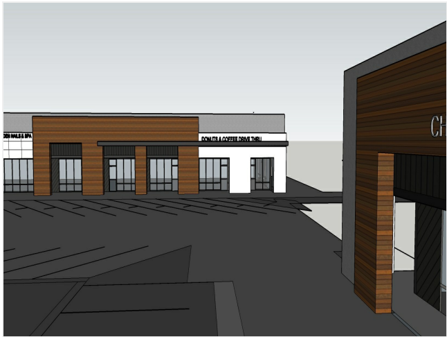
Coming Soon - New Look