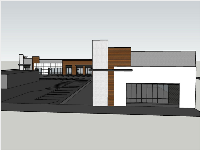
Coming Soon - New Look

7930 Dale St. & 8551 La Palma Ave, Buena Park, CA 90620