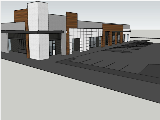
Coming Soon - New Look