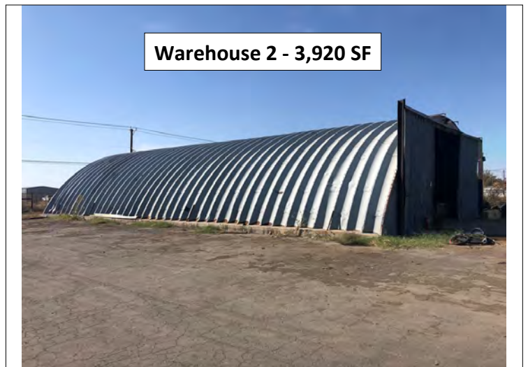
Warehouse 2 - 3,920 SF