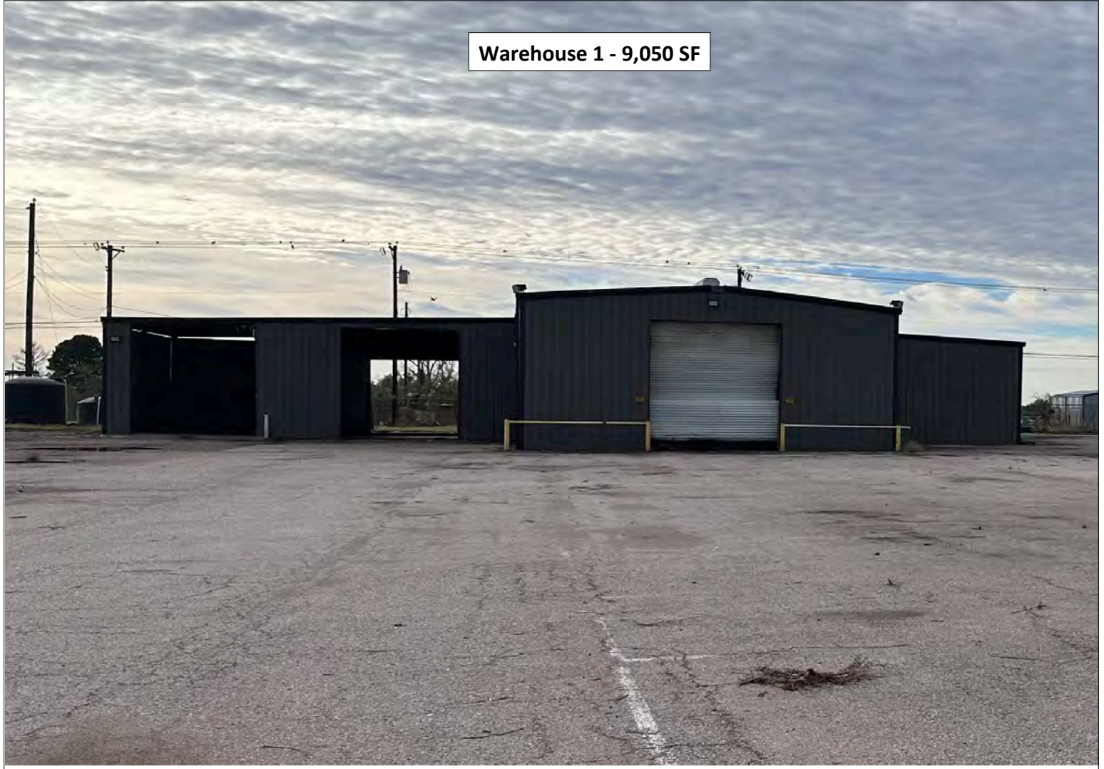
Warehouse 1 - 9,050 SF

8439 West University Boulevard, Odessa, TX 79764