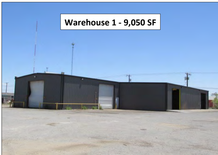
Warehouse 1 - 9,050 SF