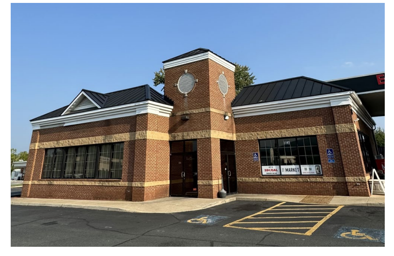
High Demand, High Growth Route 250 Pantops