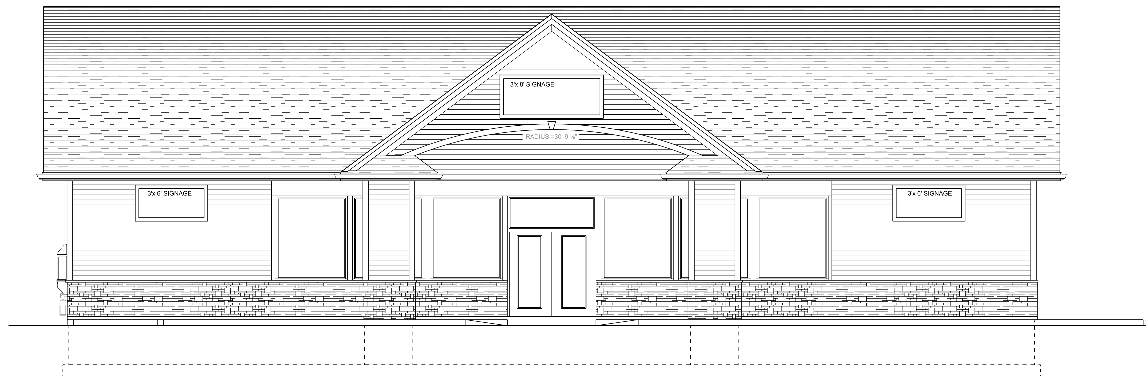
WEST ELEVATION SCALE: 1/4" = 1'-0"