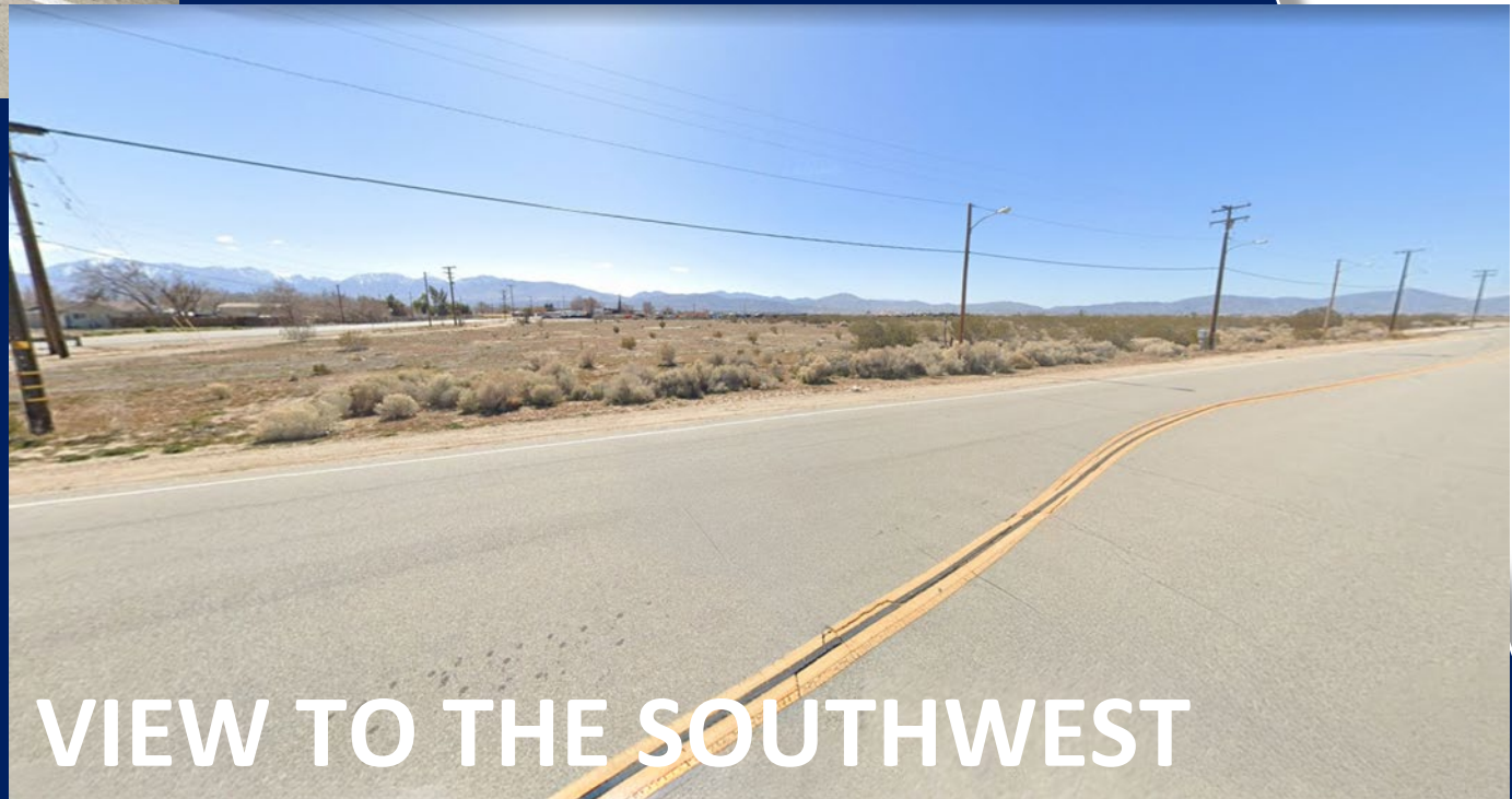
VIEW TO THE SOUTHWEST