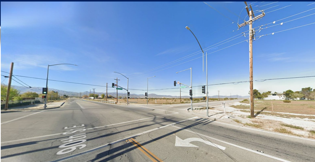
VIEW TO THE SOUTH