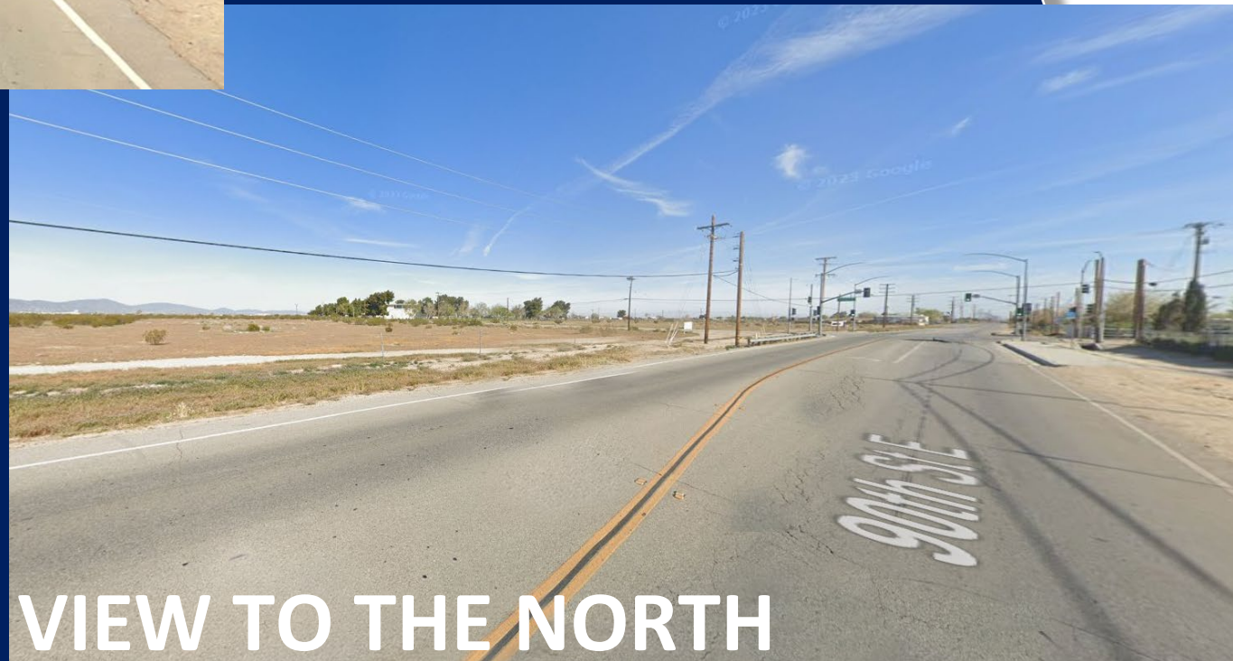
VIEW TO THE NORTH