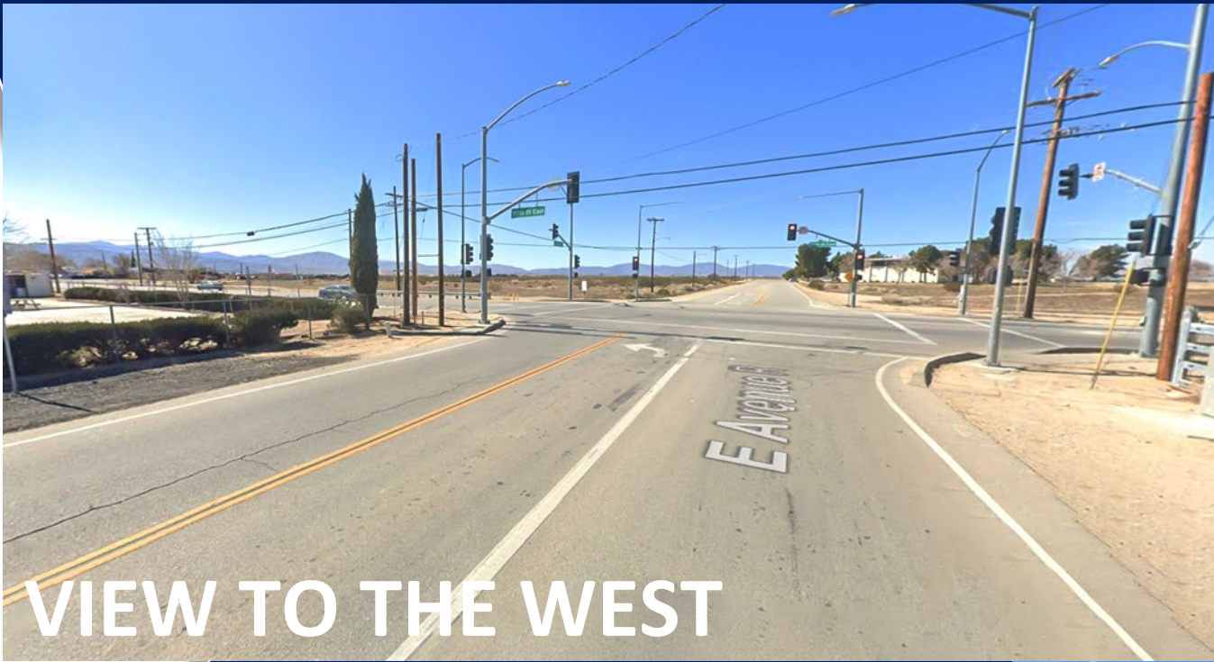
VIEW TO THE WEST