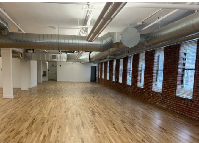
View down Market