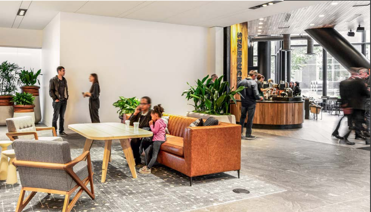
ON-SITE DINING OPTIONS INCLUDING HOMEGROWN AND STARBUCKS