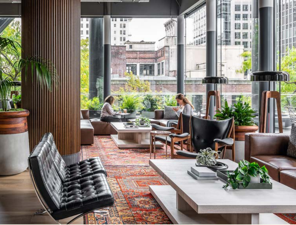
CURATED SPACE FOR COLLABORATION OR FOCUS