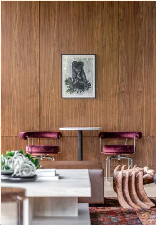
ORGANIC BREAK AREAS