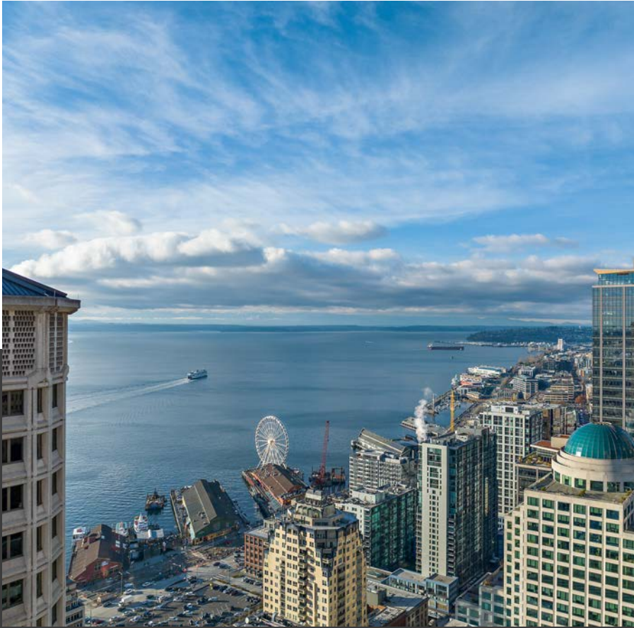
DRAMATIC WATER VIEWS