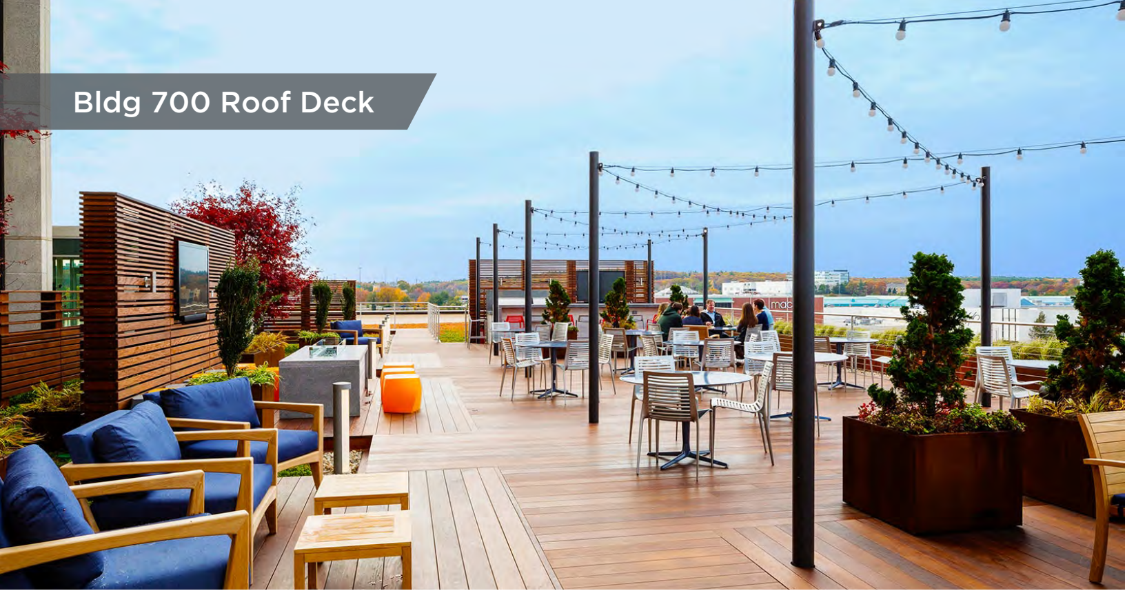
Bldg 700 Roof Deck