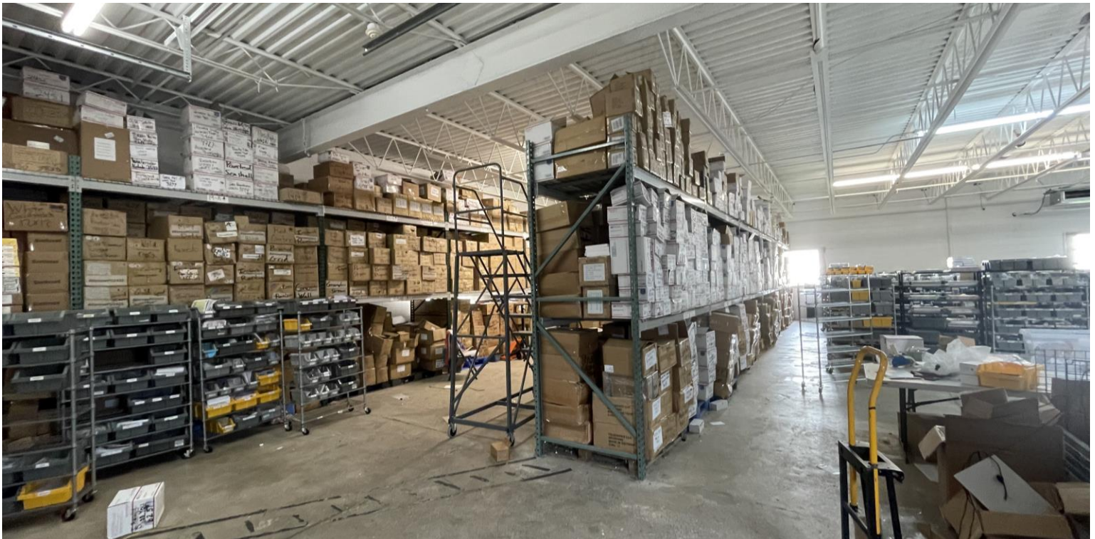
Warehouse area (some racking to remain)

Independently Owned and Operated / A Member of the Cushman & Wakefield Alliance