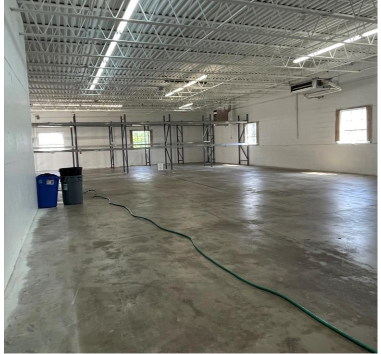
Clean warehouse area