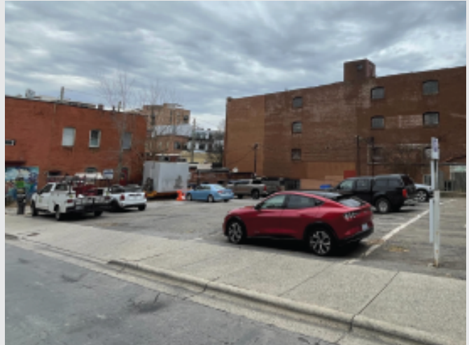
Parking lot views from 76 College St.