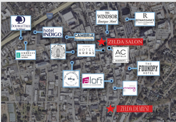
Map of hotels and proposed Zelda Salon hotel location and flagship hotel, Zelda Dearest.