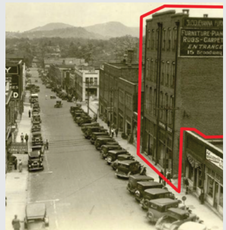
15 Broadway Property View including 76 College St. parking (left) and a historic view from the 24 N. Lexington streetview. (right).