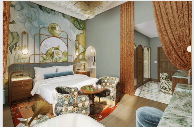
Proposed Zelda Salon hotel guestroom (left and right)