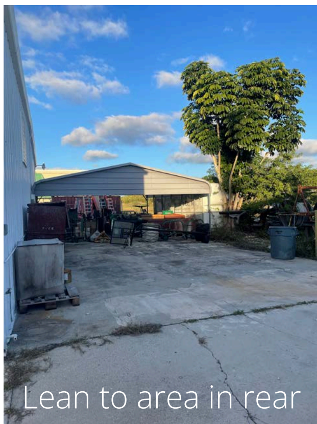
Lean to area in rear