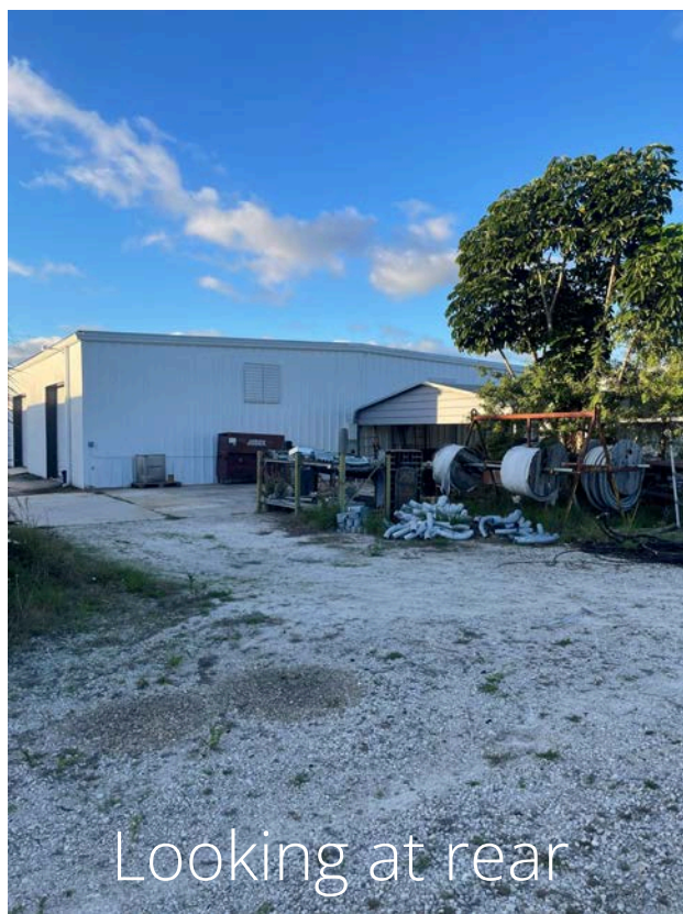
Looking at rear