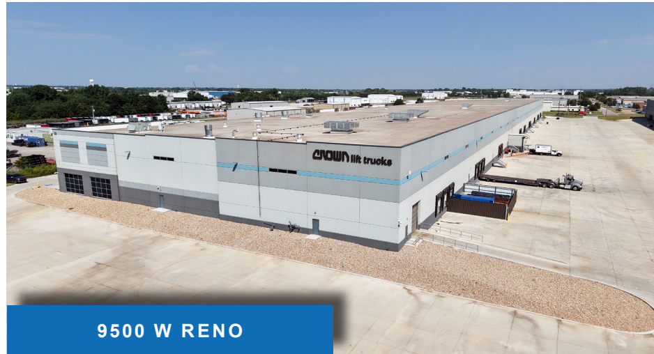
9500 W RENO

Water/Sewer: City of Oklahoma City 8" sewer main and 2" water main