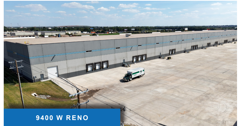
9400 W RENO