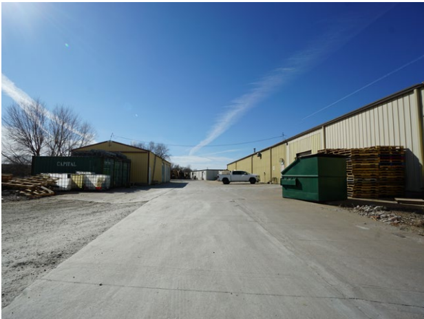
View to the West