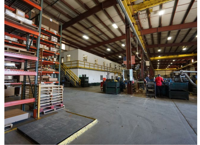
Load Area & Second Floor Office Space