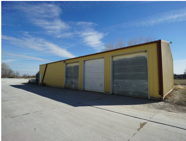
Pole Shed on South Side of Building