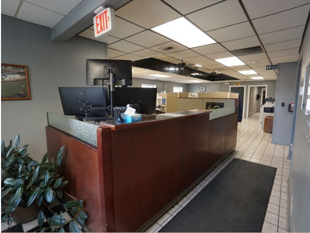
Reception Area (West Side)