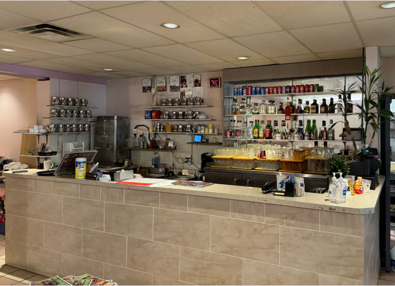
Restaurant Bar Countertop

FOR LEASE | 10133 97 Street NW, Edmonton AB