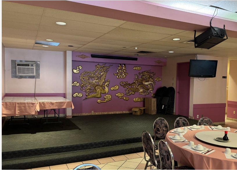
Back Raised Seating Area/Stage