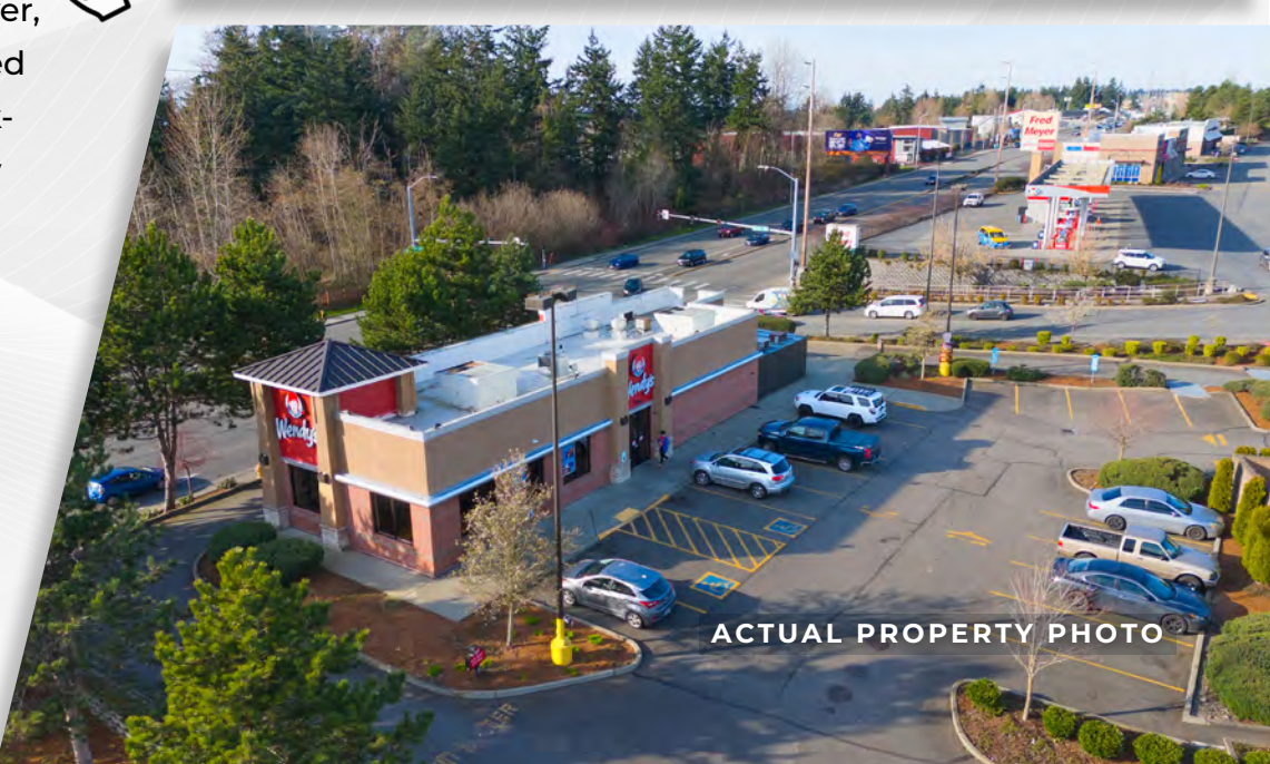
ACTUAL PROPERTY PHOTO