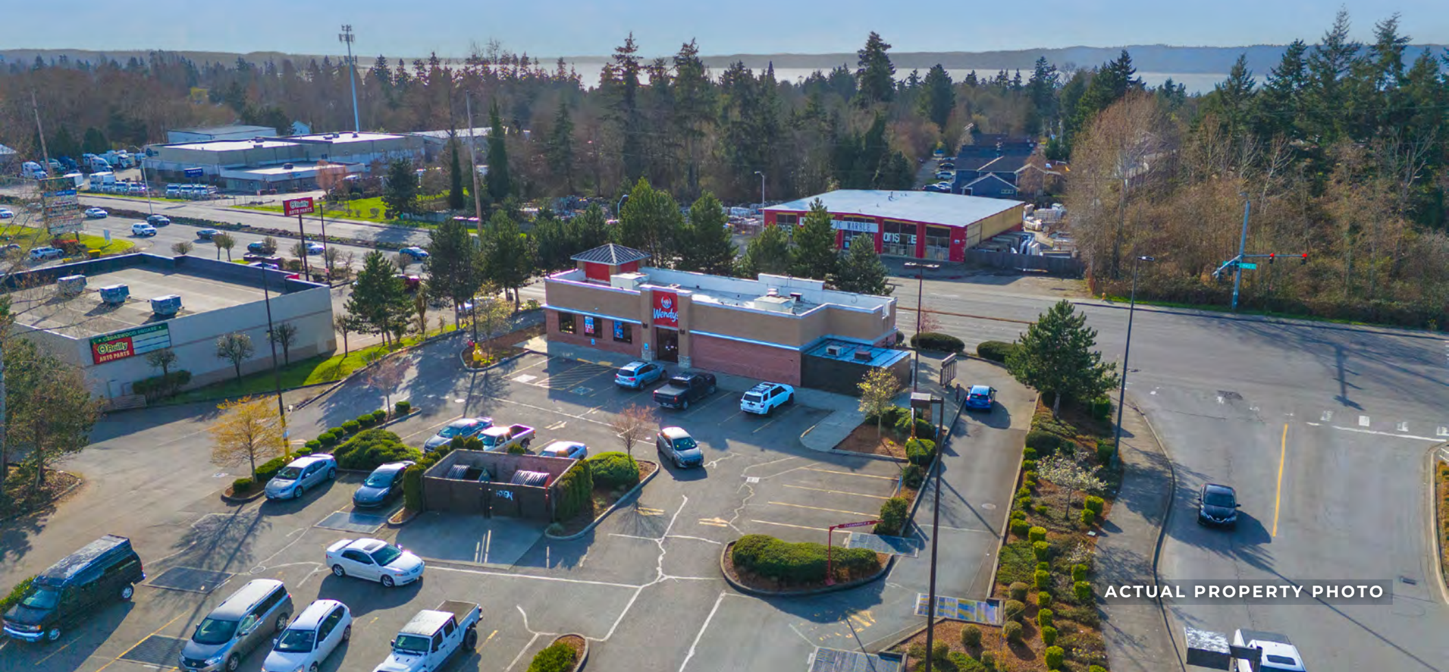
ACTUAL PROPERTY PHOTO