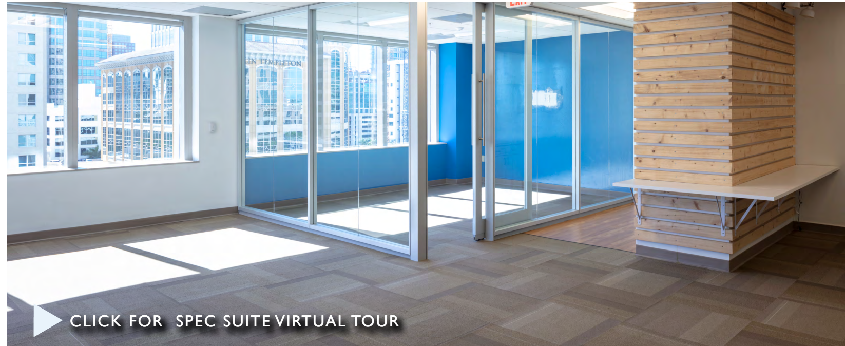
▶ CLICK FOR SPEC SUITE VIRTUAL TOUR