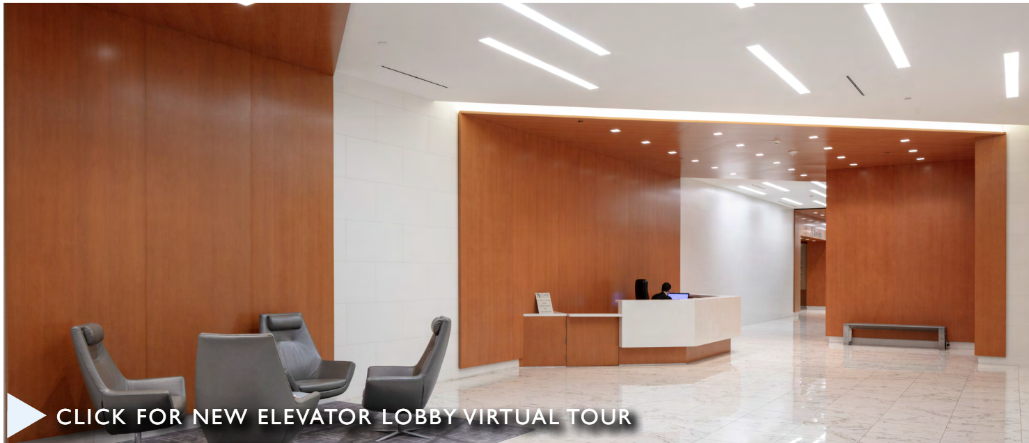
CLICK FOR NEW ELEVATOR LOBBY VIRTUAL TOUR