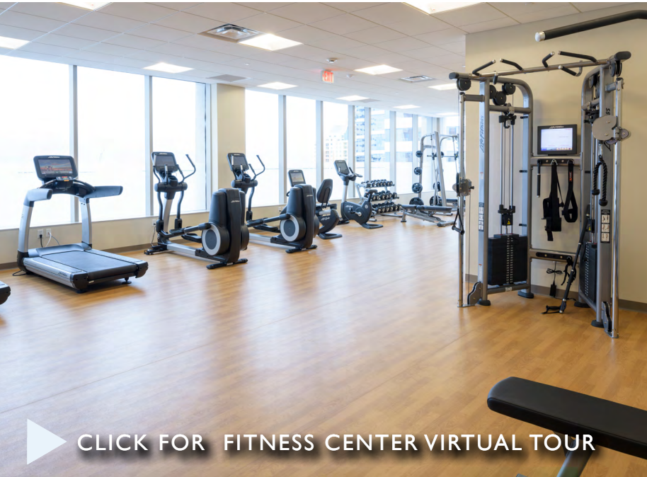
▶ CLICK FOR FITNESS CENTER VIRTUAL TOUR