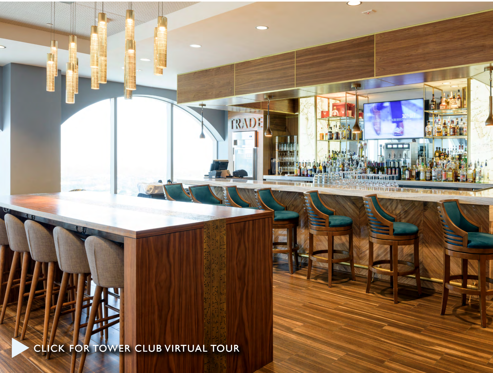
▶ CLICK FOR TOWER CLUB VIRTUAL TOUR