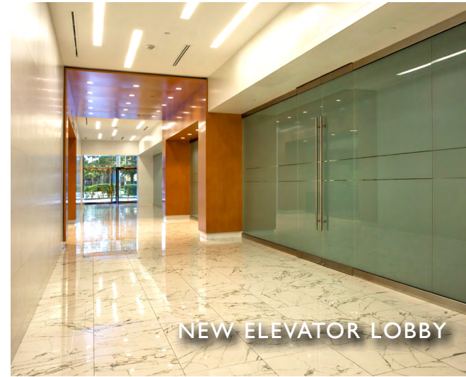
NEW ELEVATOR LOBBY