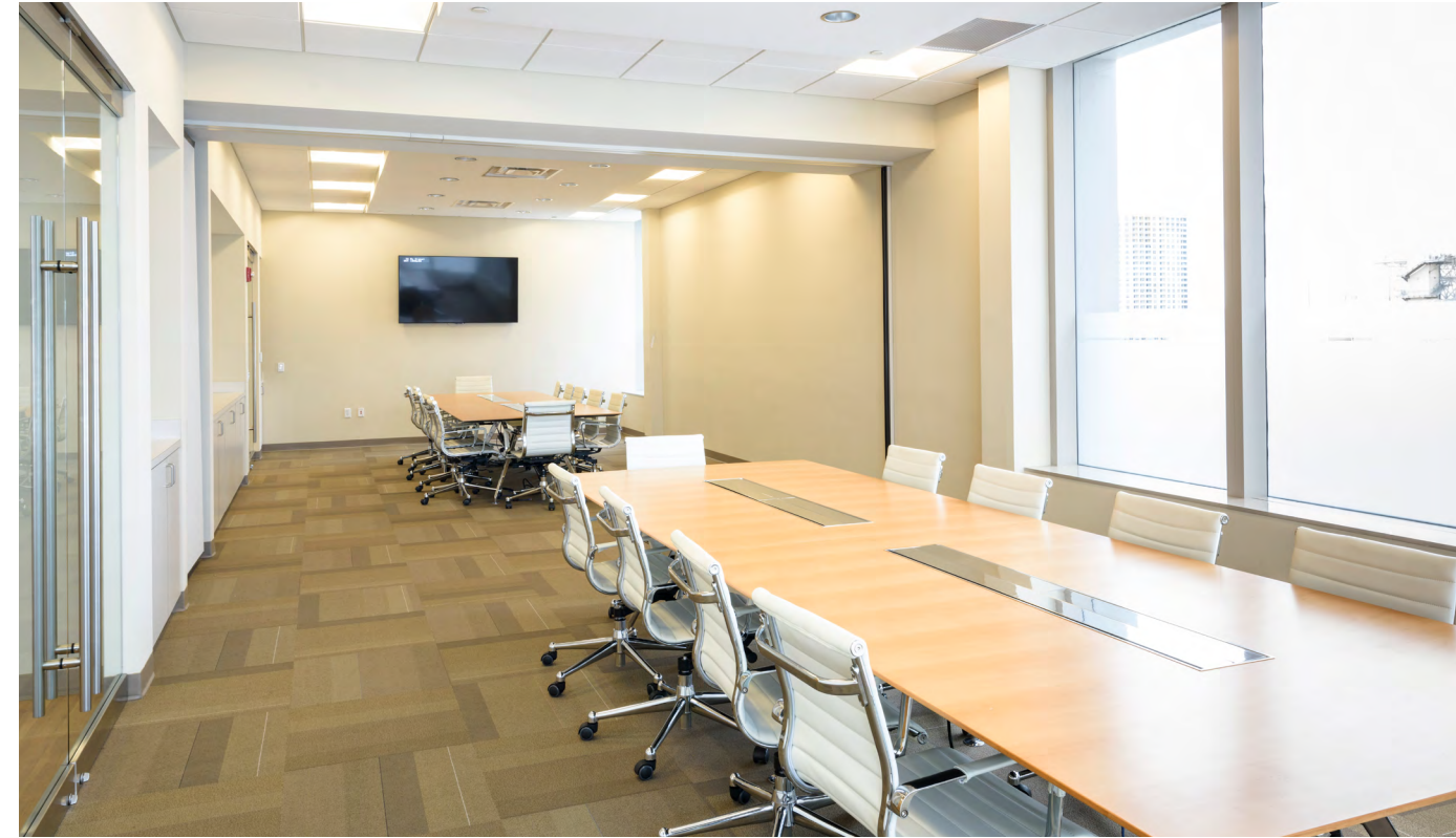
CLICK FOR CONFERENCE VIRTUAL TOUR