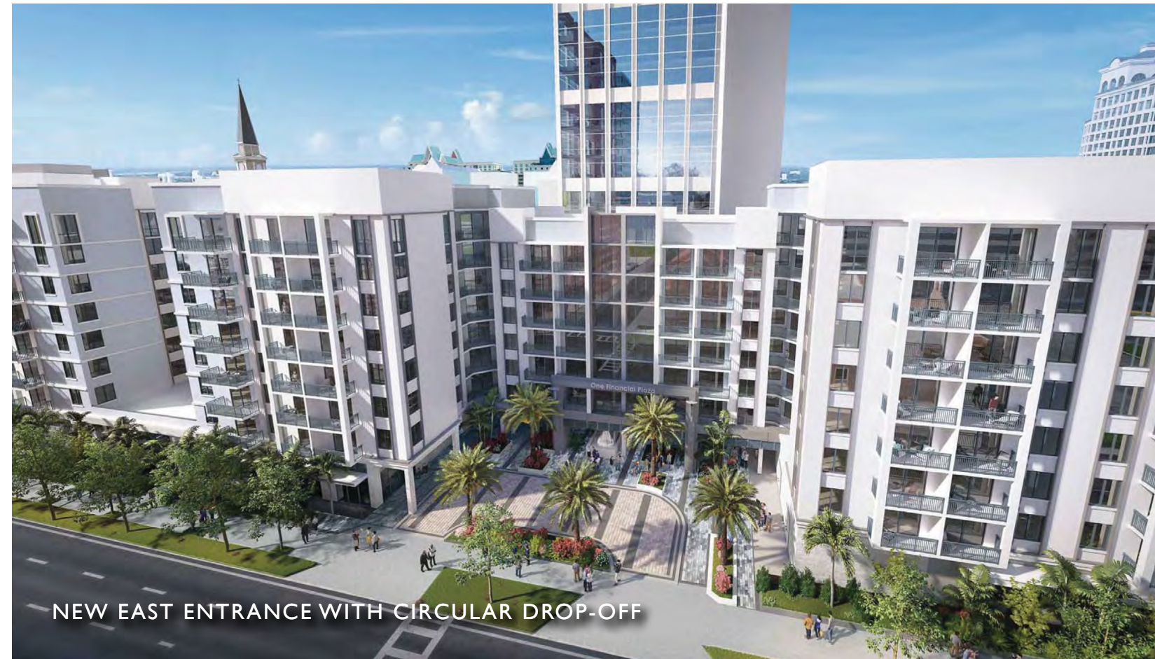
NEW EAST ENTRANCE WITH CIRCULAR DROP-OFF