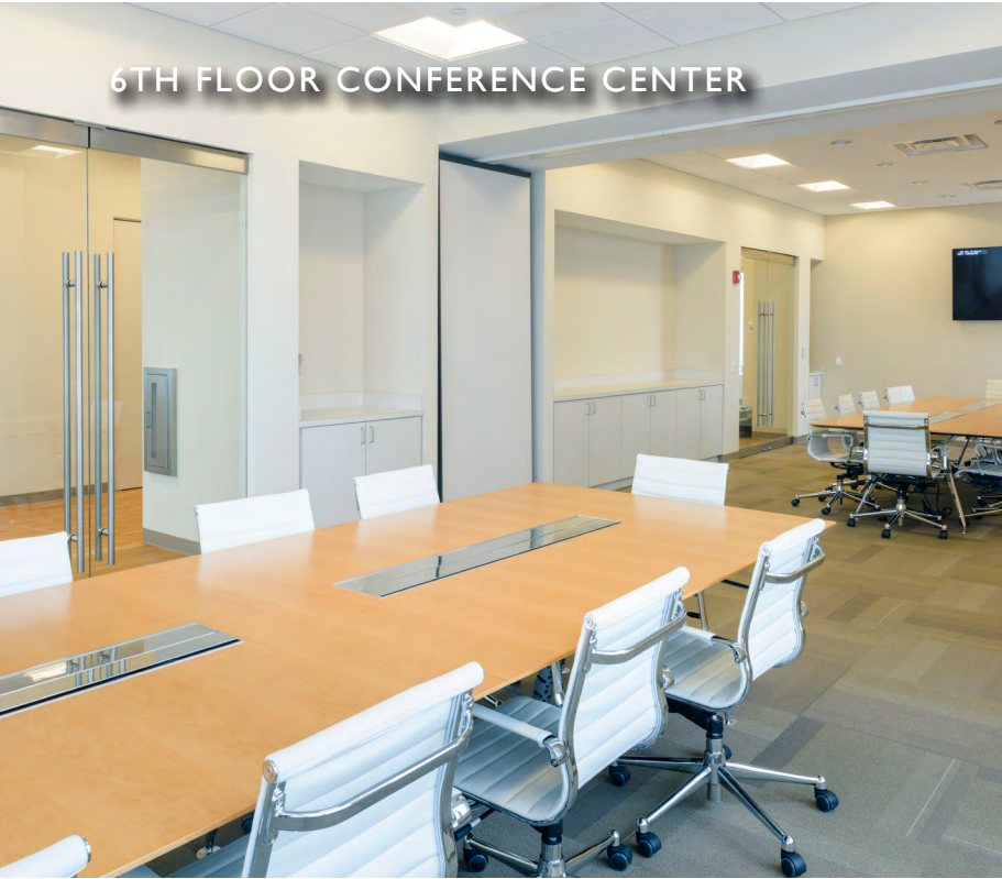
6TH FLOOR CONFERENCE CENTER