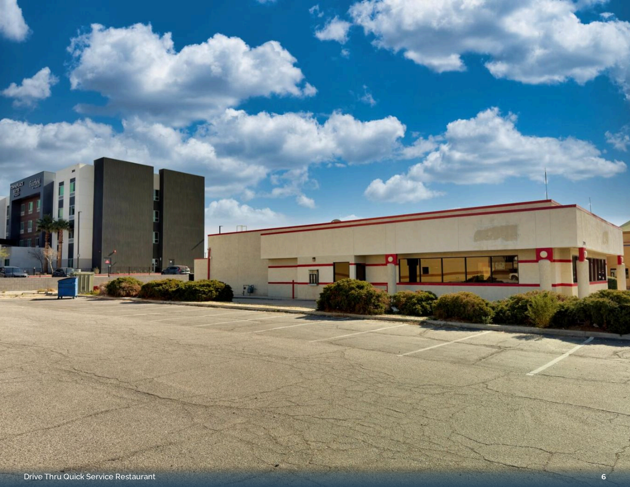
Drive Thru Quick Service Restaurant