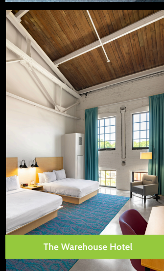
The Warehouse Hotel