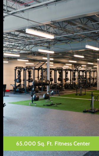
65,000 Sq. Ft. Fitness Center