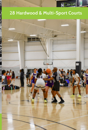
28 Hardwood & Multi-Sport Courts

Though it eventually closed in the early 2000s, the site has found new life as Spooky Nook Sports Champion Mill—a vibrant complex that honors its legacy while serving the community in bold, new ways.