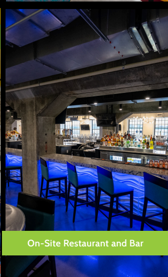
On-Site Restaurant and Bar