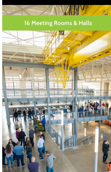
16 Meeting Rooms & Halls