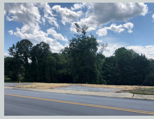
903 and 919 Fleming St Hendersonville NC