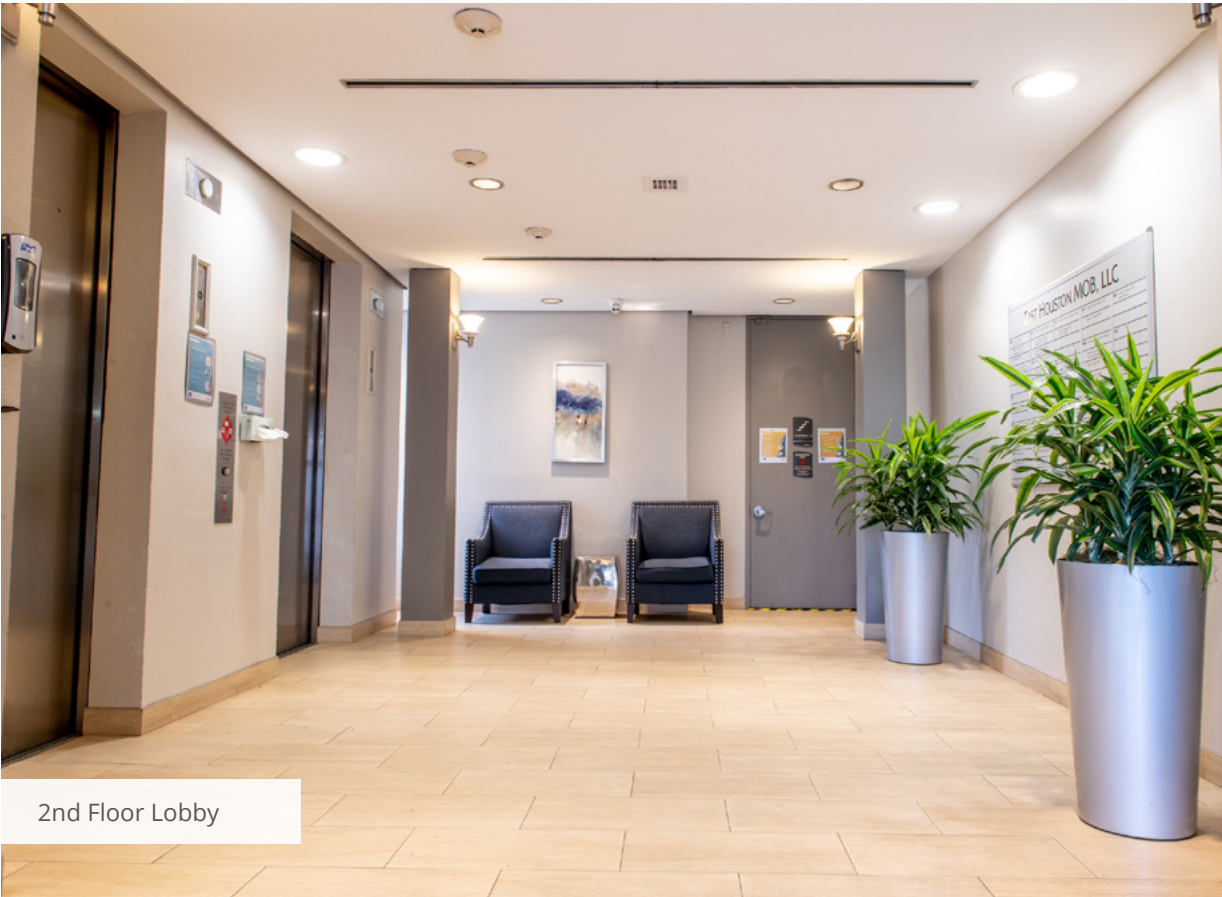
2nd Floor Lobby