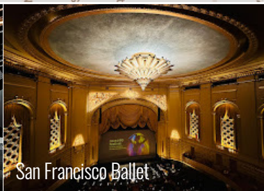
San Francisco Ballet