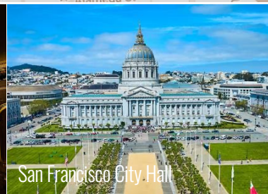
San Francisco City Hall