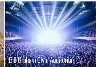
Bill Graham Civic Auditorium