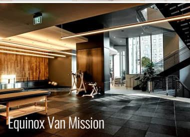
Equinox Van Mission