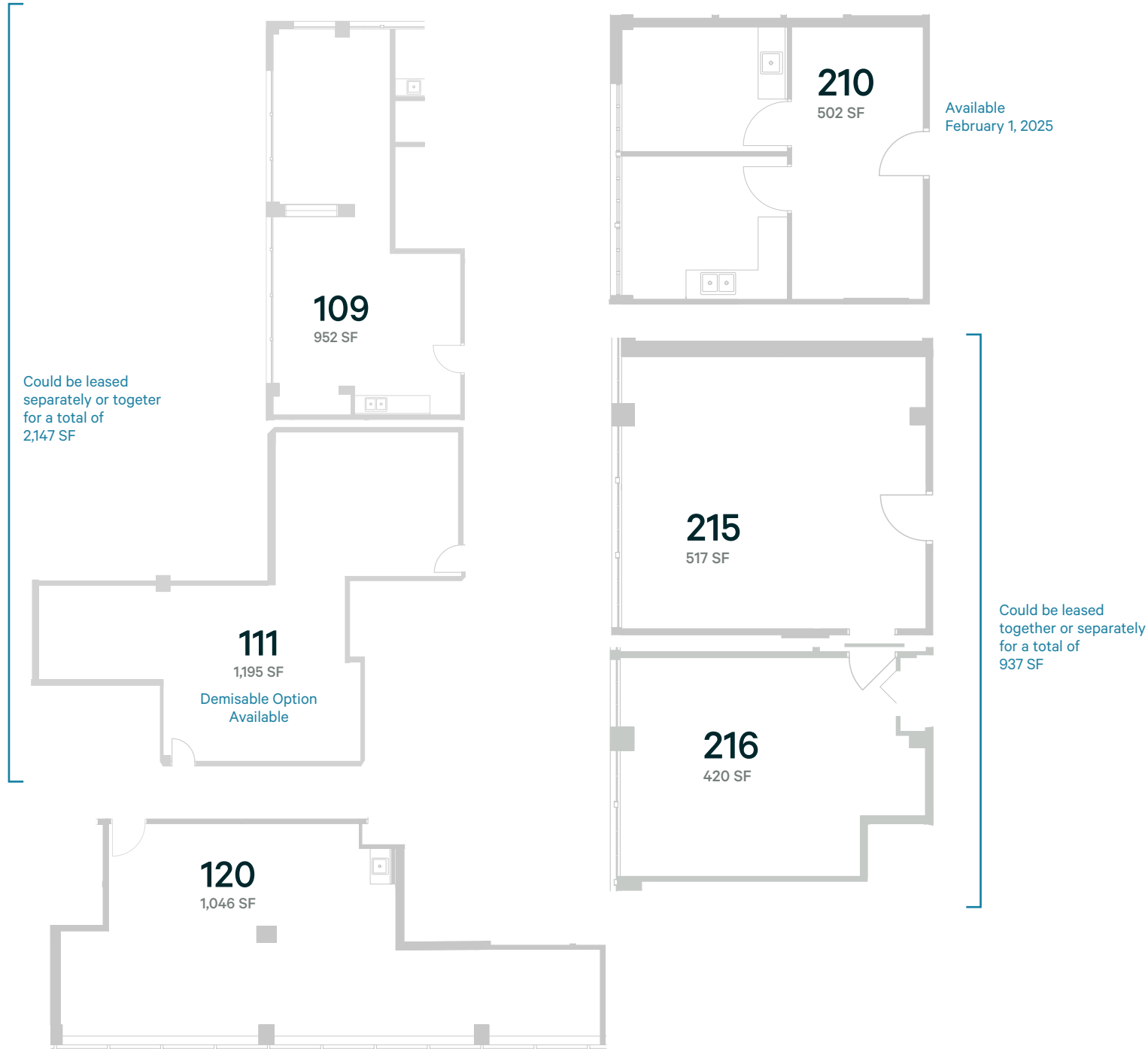
FLOOR PLANS NOT TO SCALE