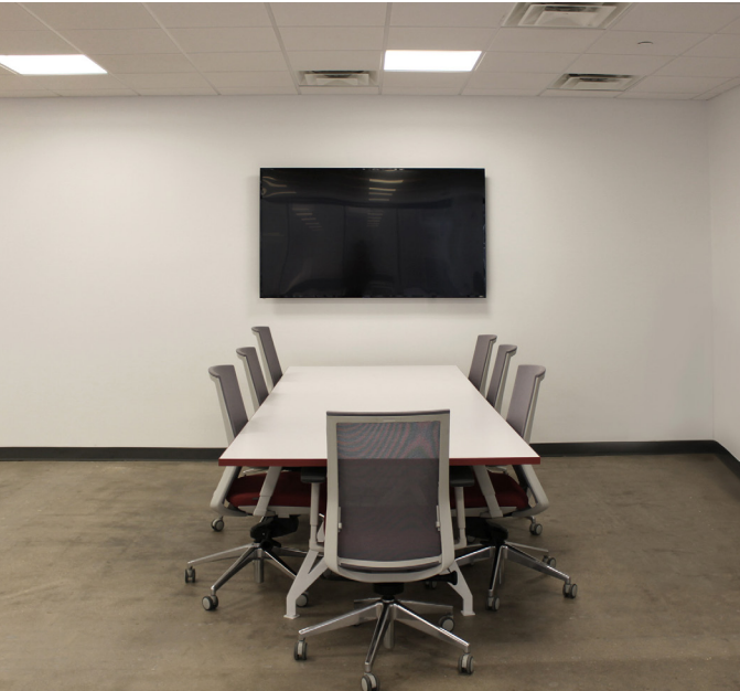
777 Taylor Street