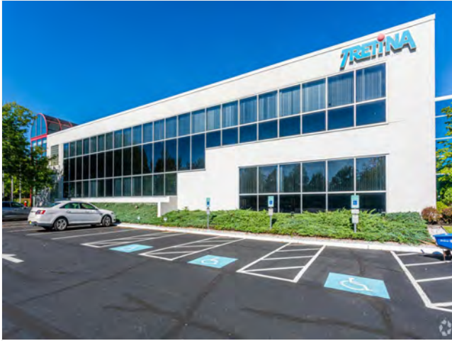
Side of Building