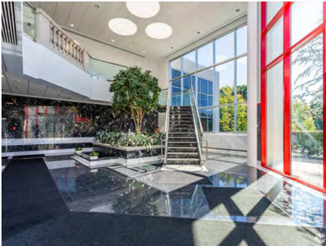
Lobby - Building 2