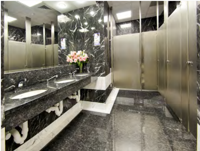
Building 2 Restroom