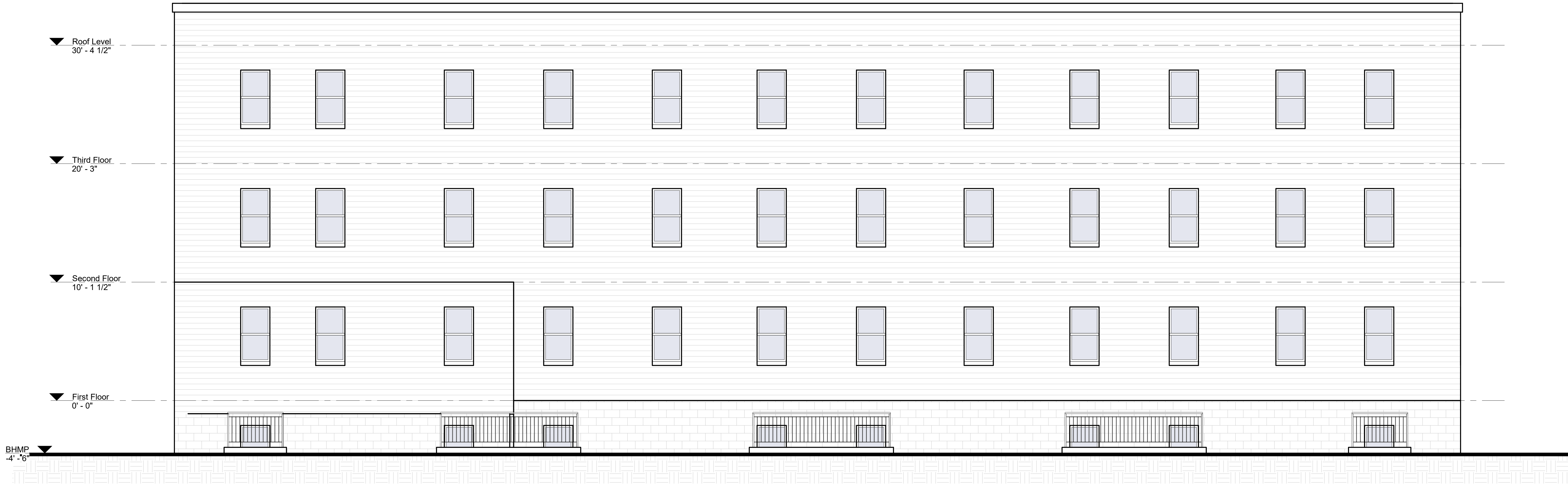
2 LEFT SIDE ELEVATION 1/4" = 1'-0"