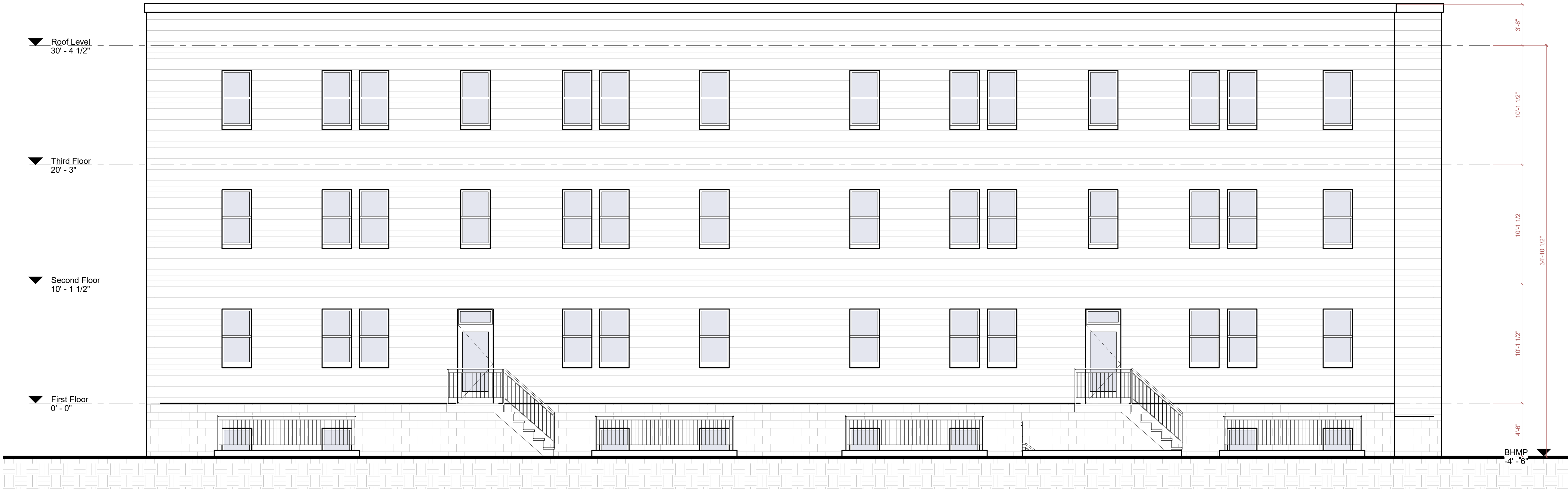
1 RIGHT SIDE ELEVATION 1/4" = 1'-0"