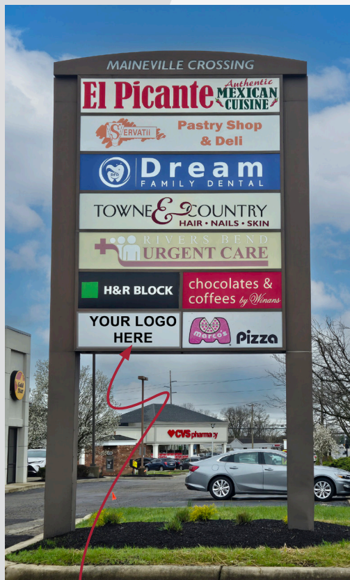
Pylon panel available