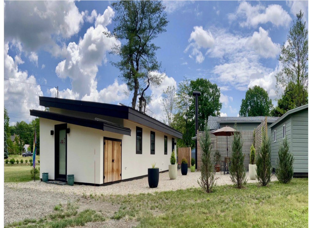
Rear Exterior and Courtyard