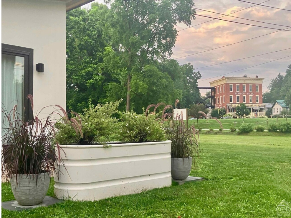
View of Bartlett House from Property