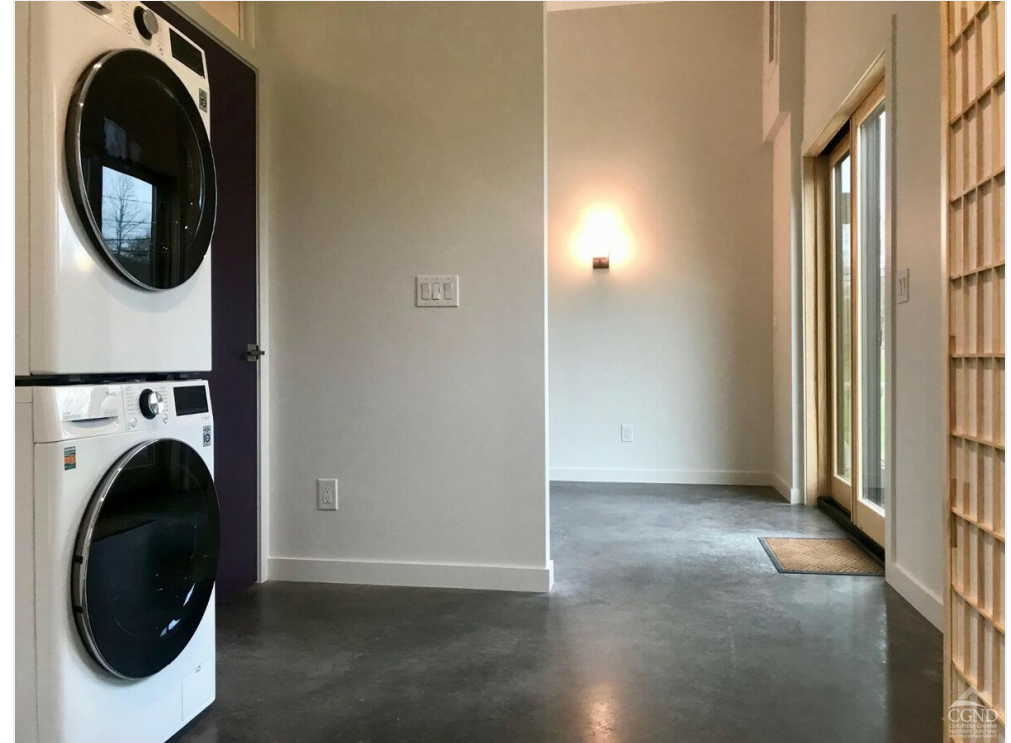
Laundry Area off Bedroom