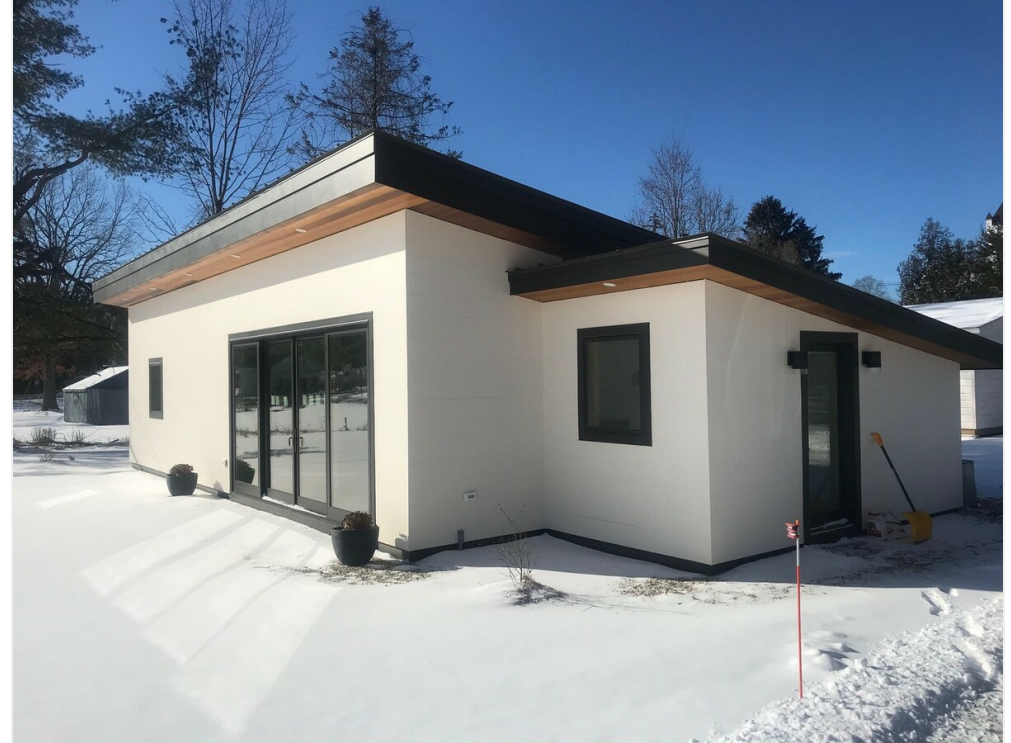
Front Exterior Winter