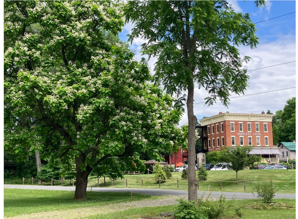
View of Bartlett