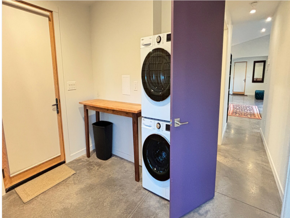
Laundry Area off Bedroom